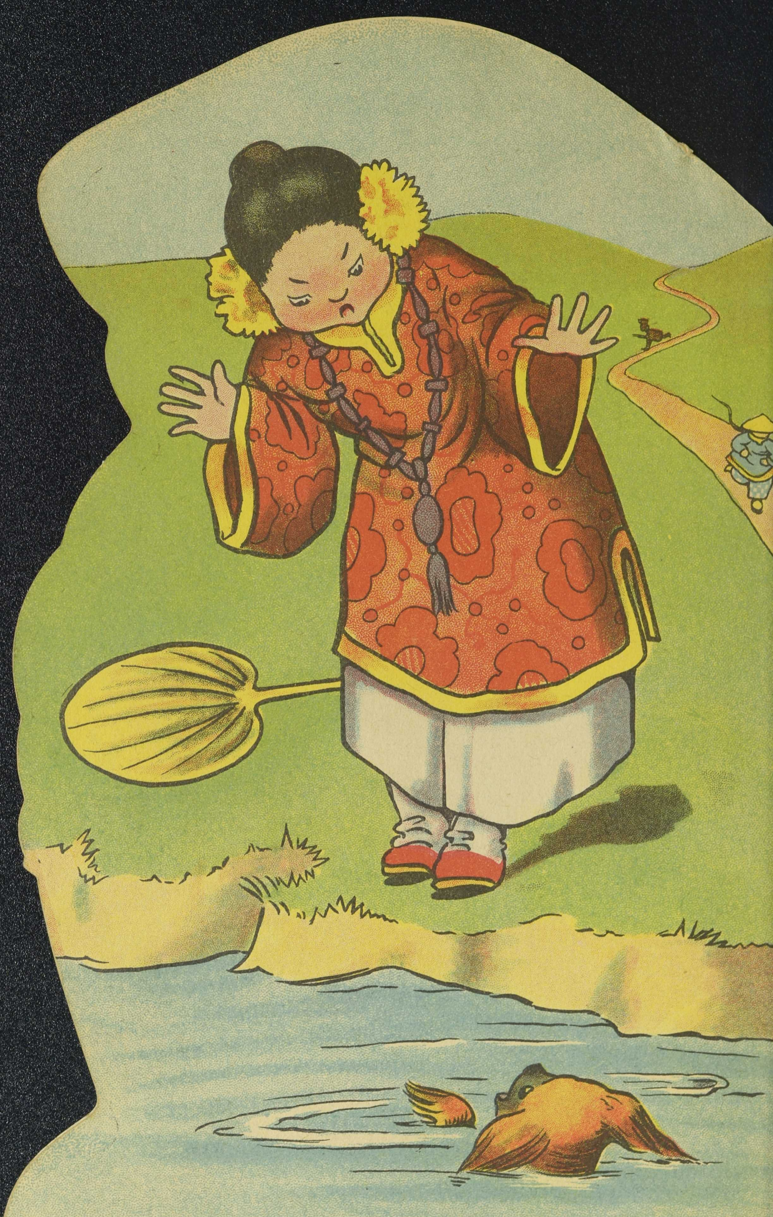
SHE MAKES SUCH A NOISE THAT THE PRINCESS' LITTLE DOG GETS FRIGHTENED & FALLS INTO THE RIVER.