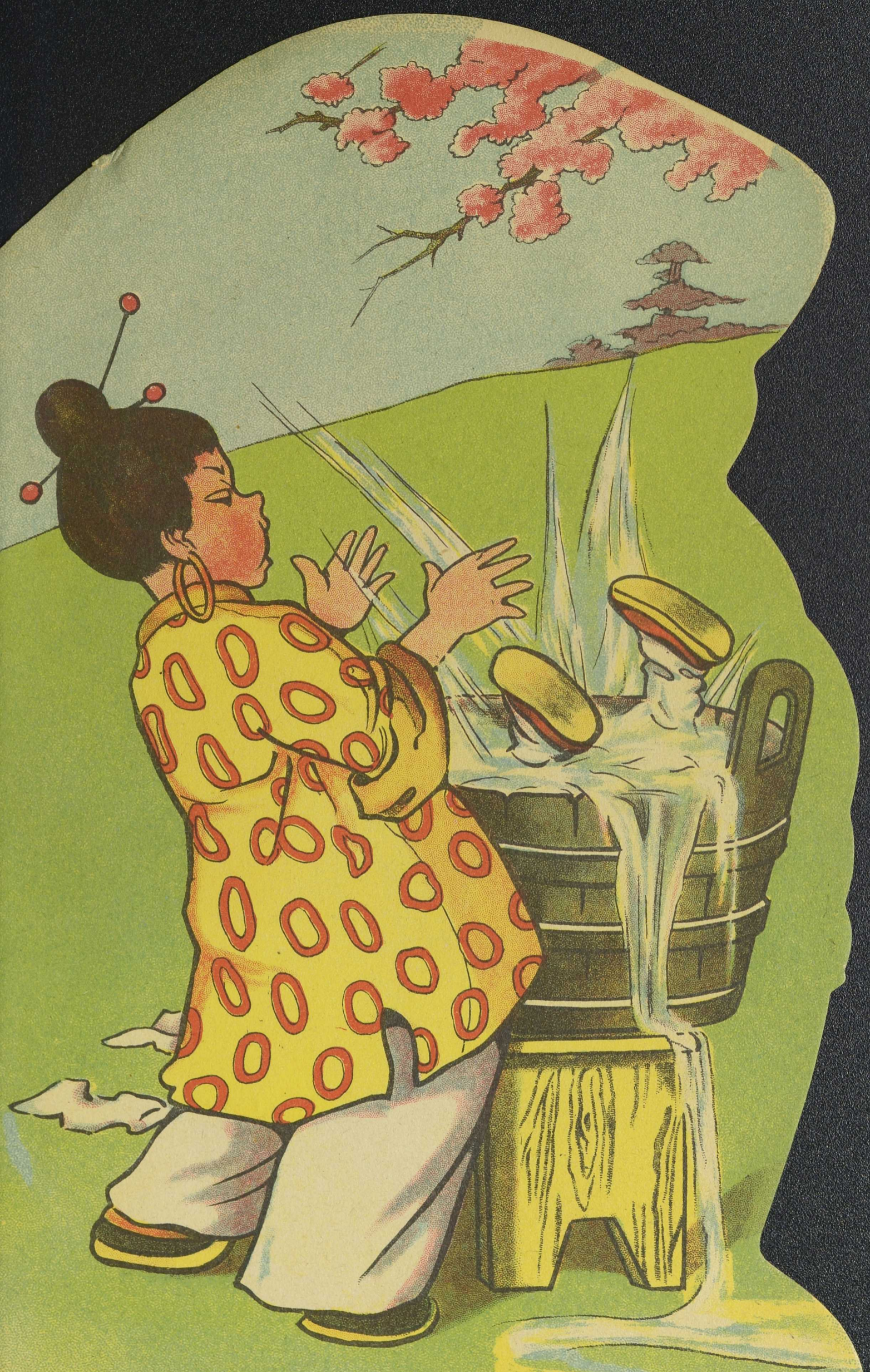
THE ROYAL WASH LADY HAPPENS TO BE WASHING THE EMPEROR'S SHIRTS & SOCKS JUST BENEATH & HIS COAT GIVING WAY CHIN-CHIN-CHINAMAN FALLS INTO THE ROYAL WASH TUB.