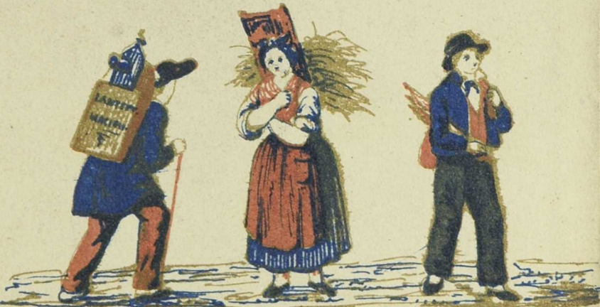
Lanterne Magique Magic lantern La paille Straw Lapins Rabbits