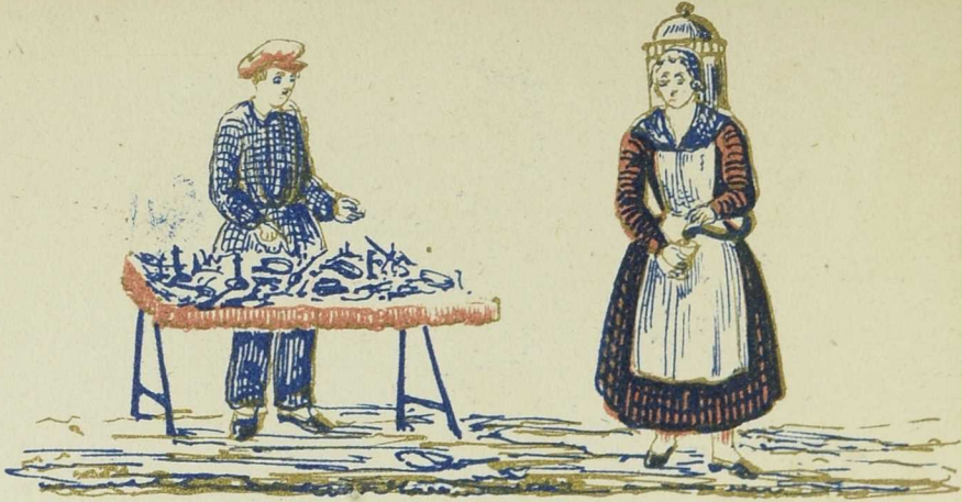
Six sous à la chaude ' all hot