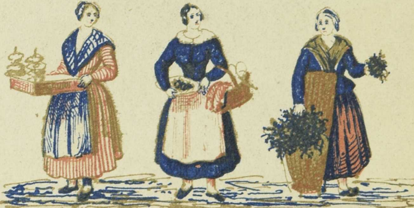
Colifichets' Bird buis Cuits Roneaux' Prunns