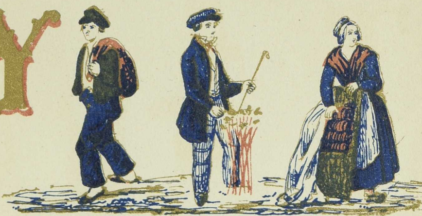
ya ramonner Sweep Ganes Cannes Mottes Turf