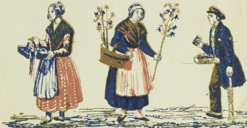
Lacets Laces pleurez pleurez Cry Cry Almanachs Almanaks