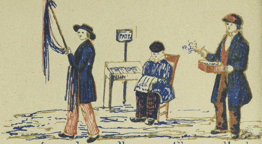
Jarretières Garters Journaux Newspapers Allumettes Matches