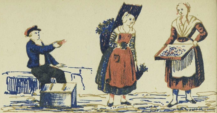
Decrottez'shoe black du Cresson Water Cresses d'Ianis Aniseed