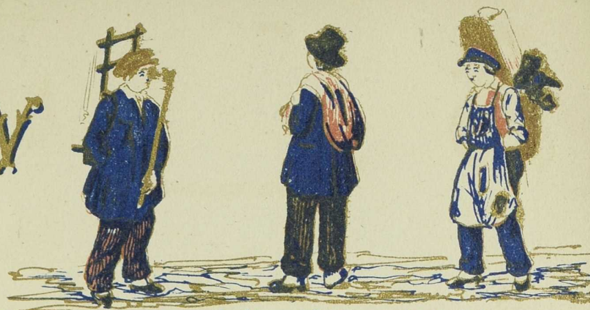
Vitrier Glazier Vieux chiffons Old Paqs Carlo Solies to ment