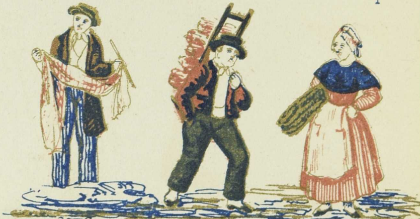
Mousseline Muslin Cotterets ' Façgots Paillassons ' mats.