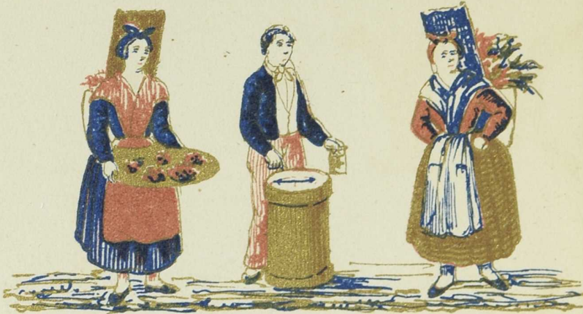
3s. letat 3s. the lot tout coupl'm gain'e ' always coin 3s. Paquet ' 3 sous the parcel