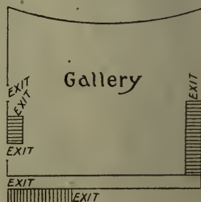
PLAN SHOWING EXITS OF GRAND OPERA HOUSE