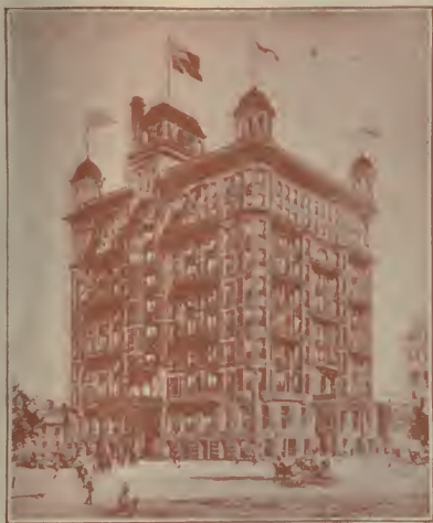
Temple Building, I.O.F.