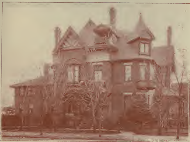
St. Margaret's College.

In the matter of ladies' colleges, Toronto is specially well provided, the various religious denominations being well represented. Some of the principal are: St. Hilda's (affiliated with Trinity University), Bishop Strachan School