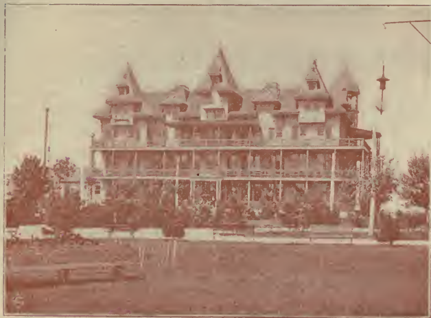
Hotel Hanlan, Toronto Island.

It is the first sight of land which greets the traveller from across the lake, and the appearance of the low sandy shore,