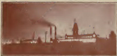
Night at the Exhibition.