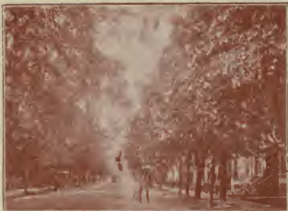
On the Belt Line.