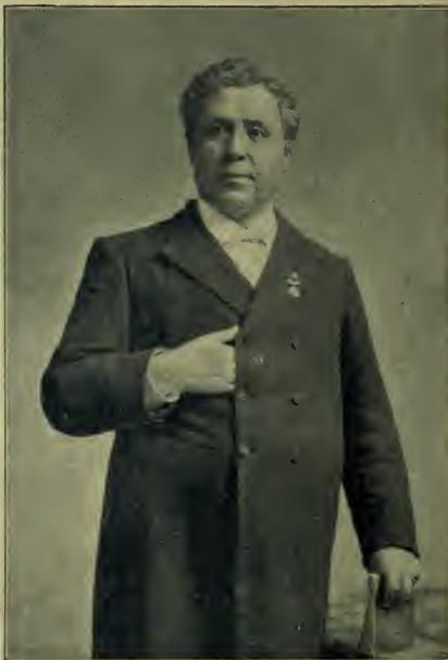
ORONHYATEKHA, M.D. Supreme Chief Ranger I.O.F.