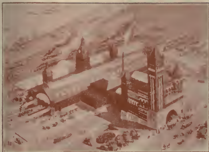
The Union Station.

“cool drinks” and more solid nourishment to the crowds of pleasure seekers. Groups of picknickers are everywhere to be found gathered around their al fresco repasts, struggling with refractory lunch baskets, or with their more or less varied contents.