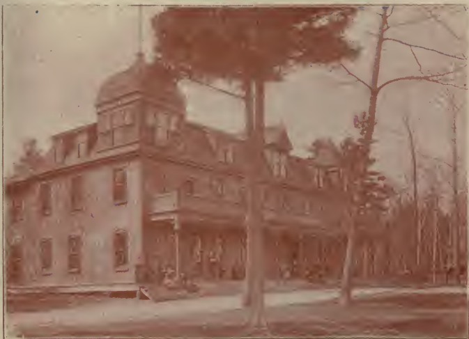
Hotel Louise, Lorne Park.

combining all the advantages and attractions of a first-class summer sojourning place, with rapid transit to and from the city, Lorne Park takes front rank. It is but 15 miles distant from Toronto and is well served by the excellent train service of the Grand Trunk Railway. The journey by boat (the Greyhound) from Toronto is a delightful trip, much patronized by excursionists and the residents of the Park. The Greyhound leaves the wharf at the foot of Yonge street. The view of the Park from the water is very fine, but a closer inspection is required to reveal its hidden beauties. Lorne Park consists of 88 acres of hill and dale,