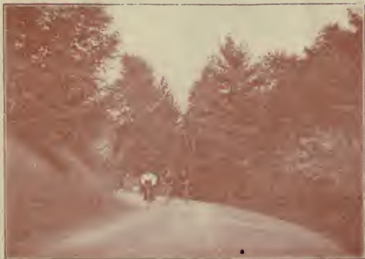
In High Park.

A considerable portion, however, has been reclaimed, modernized and improved. There will be found wide level roads, the delight of bicyclist and horseman. Refreshment pavilions offer their tempting displays of