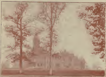
Upper Canada College.