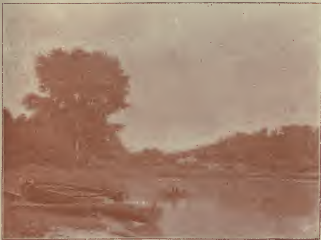
The Picturesque Humber.

The salubrity of the climate, the purity and excellence of