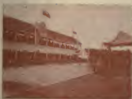
At the Island.

ernor of Upper Canada during the previous year, arrived from England and established the town of York, landing at a spot near the mouth of the Don River. In 1834 the town was incorporated as a city, resuming its old Indian name Toronto. This title signified "a place of meeting" for the