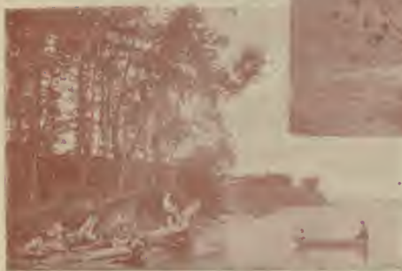
Along the Lake Shore.

Among other interesting features, Toronto enjoys the distinction of possessing the highest building in Canada. This is the magnificent Temple at the corner of Richmond and Bay streets, headquarters of the Independent Order of Foresters. The building was erected under the special superintendence of Dr Oronhyatekha, Supreme Chief Ranger of the Order. Visiting Foresters are always welcome.