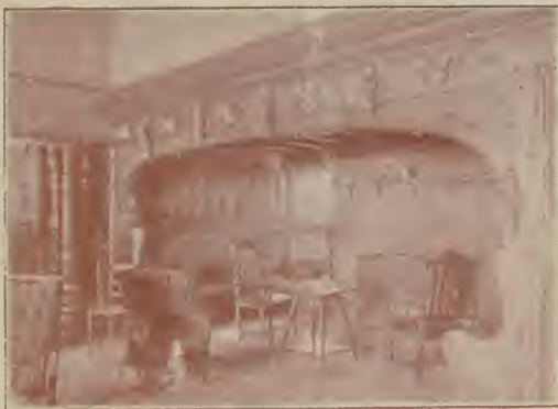
Interior Hunt Club.

The August Regattas, held under the auspices of the various aquatic clubs, will fully sustain Toronto's reputation