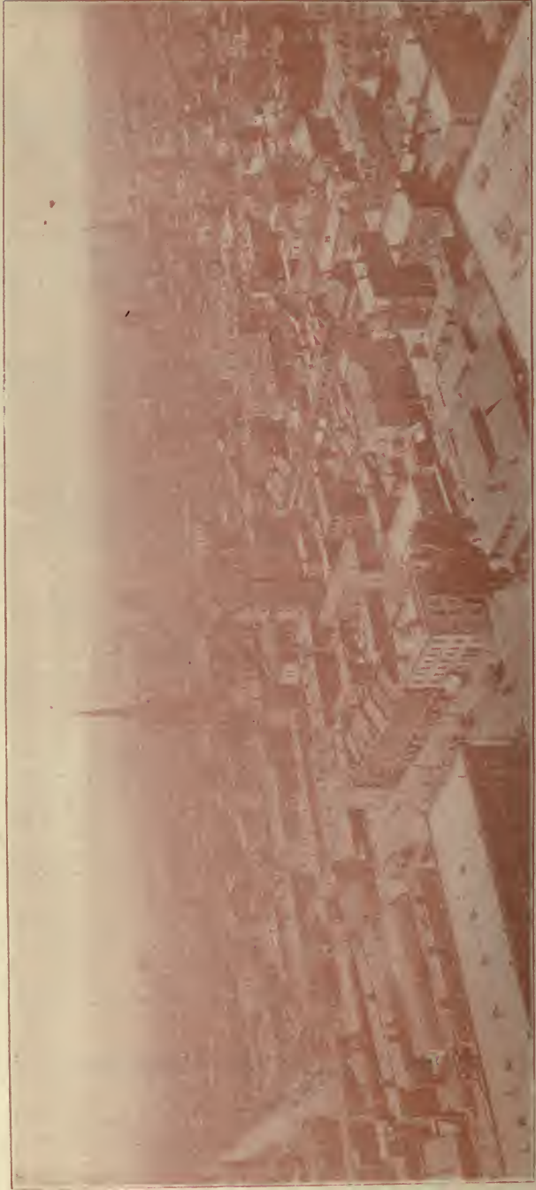
CITY OF TORONTO.