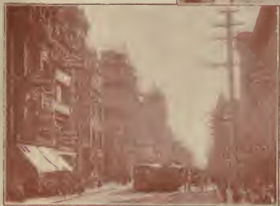
In the Business Section.

their bent and indulge romantic fancies at the far eastern point, known as "Ward's," where the habitations of man are scattered, and the ownership and occupation of the soil are disputed by the frogs—the "musicians of the marsh"