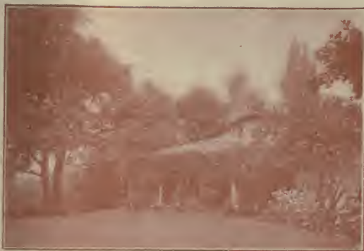
Howard Cottage, High Park.