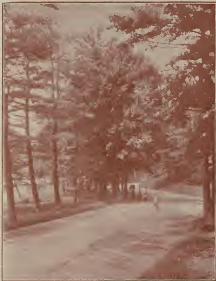
Drive in High Park.

An annual affair of more than local or even Provincial importance is the Industrial Exhibition, held during the first two weeks of September. The buildings erected for the purpose are very extensive and yearly receive fresh additions, so great is the demand for space for exhibits. Exhibition Park—more than 100 acres in extent, in which these buildings are situated—is beautifully laid out, bordering on the lake shore. It is open to the public, except when in use for the Exhibition.