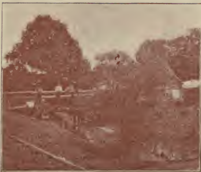
Along the Humber.

The Ontario Parliament Buildings form the chief centre of interest. The massive brown stone pile is situated in the middle of the Park, and is remarkable at once for solid strength of architecture and beauty of carving; while the interior is admirably arranged for the business of the Province. Fine statues have been erected in the Park, near the Parliament Buildings; one to the east commemorating the North-West Rebellion of 1885; to the west that of the late Hon. George Brown, journalist, politician and patriot; and a handsome monument dedicated to the memory of members of the Queen's Own Rifles who perished in the Fenian raid of 1866. Facing the Buildings is a splendid bronze statue of the late Sir John A. Macdonald, Canada's "Grand Old Man." Band concerts are held in the park during the season in the handsome band stand behind the Parliament Buildings.