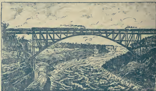
GRAND TRUNK NEW SINGLE-ARCH, DOUBLE-TRACK STEEL BRIDGE OVER NIAGARA RIVER.

From the States of New York, Pennsylvania, etc., via Niagara Falls and the new single-arch, double-track steel bridge over the Niagara gorge, through the Niagara Peninsula and Hamilton to destination.