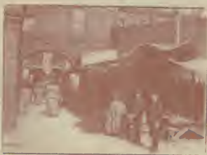
At the Market.

Only those who have some idea of the passenger business can form any conception of the untiring patience and