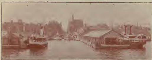
Where Summer Visitors Land.

Modern Toronto! gay, bustling, mirth-loving Toronto! A beautiful city, with wide, clean streets, massive downtown warehouses of hewn stone and brick, palatial stores thronged with armies of shoppers. Uptown, the residential thoroughfares, each with its bright border of greensward, lined with avenues of luxuriant shade trees, the leafy horse-chesnut and sturdy maple (Canada's dear emblem), flanked