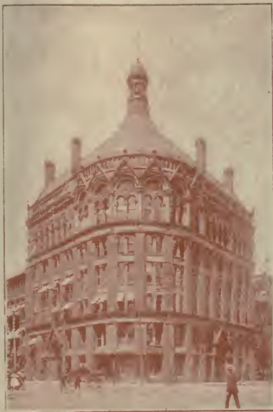
Board of Trade.

Y.C. town Club House, belongs to the Toronto Canoe Club. The officers and members of the T.C.C. are indefatigable in promoting the cause of pure amateur aquatics, and in advancing the interests of canoeing in all its delightful phases.