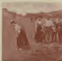
The Golf Links.

on either side by the mansions of the wealthy, or the cottages of the artisan. Such a city is Toronto, with a background of low, billowy hills, skirted east and west by beautifully laid out parks, pretty rivers and streams, and situated on a splendid harbour. Across the harbour lies the "Island," beyond and around heave and glisten the clear, cool waters of Lake Ontario. Over all, the bright blue dome of an Italian sky completes a picture as fair as one will find on this continent. No wonder is it that this city is year by year increasing in favor as a most fitting place for holding monster conventions, as an objective point for large excursions, and as an ideal abiding place during the summer season.