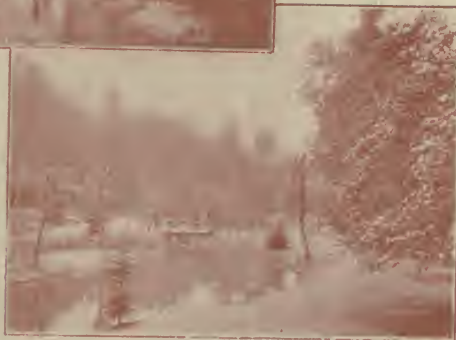
In Reservoir Park.

owing to lack of sufficient military protection for those very troublous times. In May, 1793, Lieutenant-Colonel John Graves Simcoe, appointed Gov-