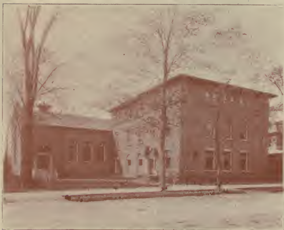
Toronto Conservatory of Music.

Opposite the Parliament Buildings, on College street, stands the handsome building of the Toronto Conservatory