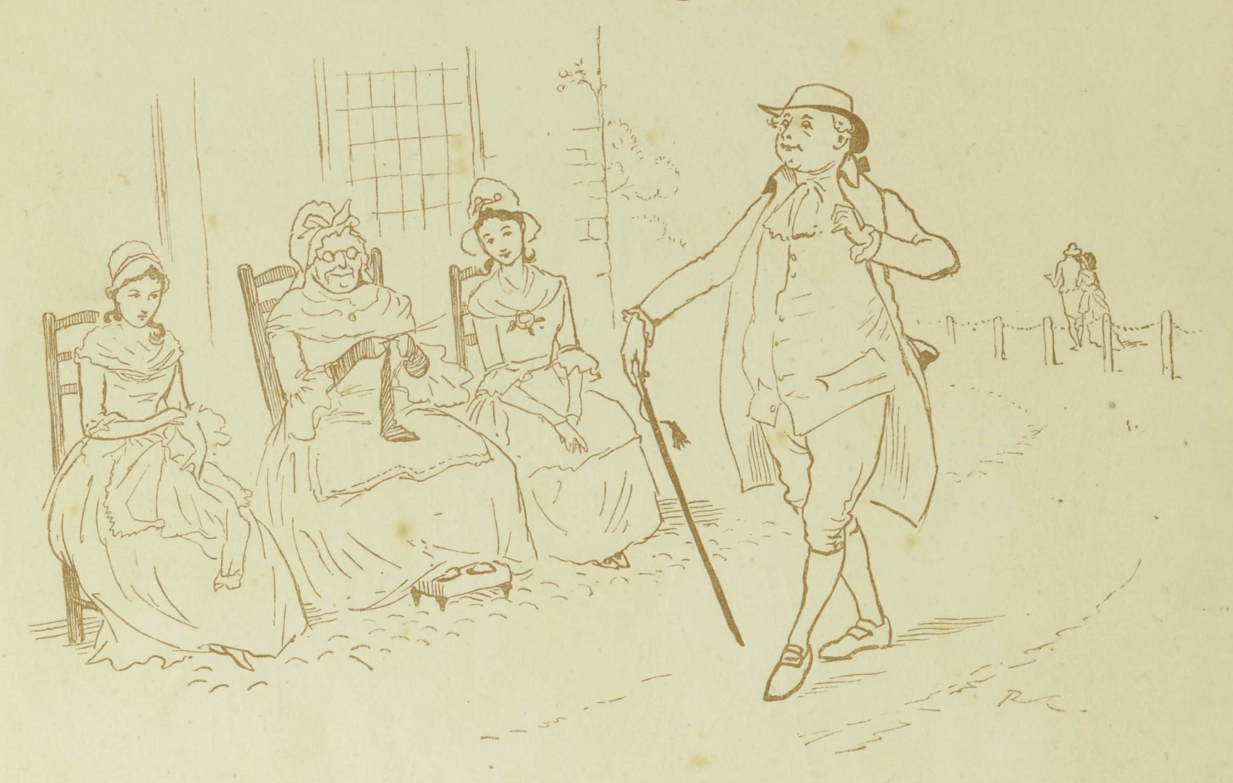
The man recover'd of the bite;

But soon a wonder came to light, That show'd the rogues they lied—