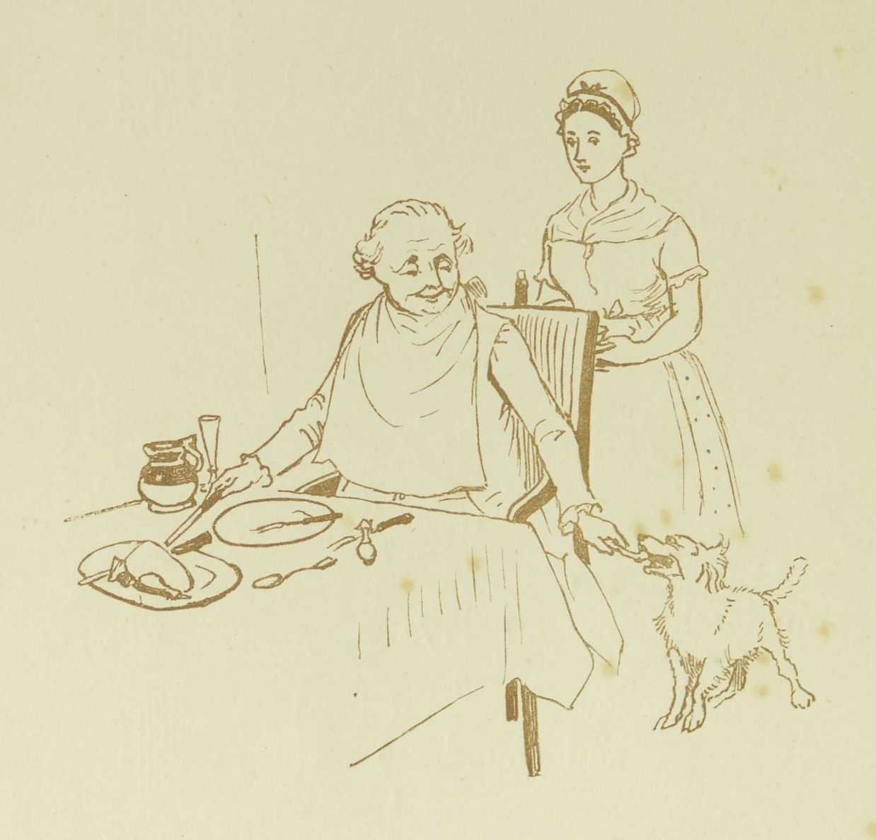
This dog and man at first were friends;