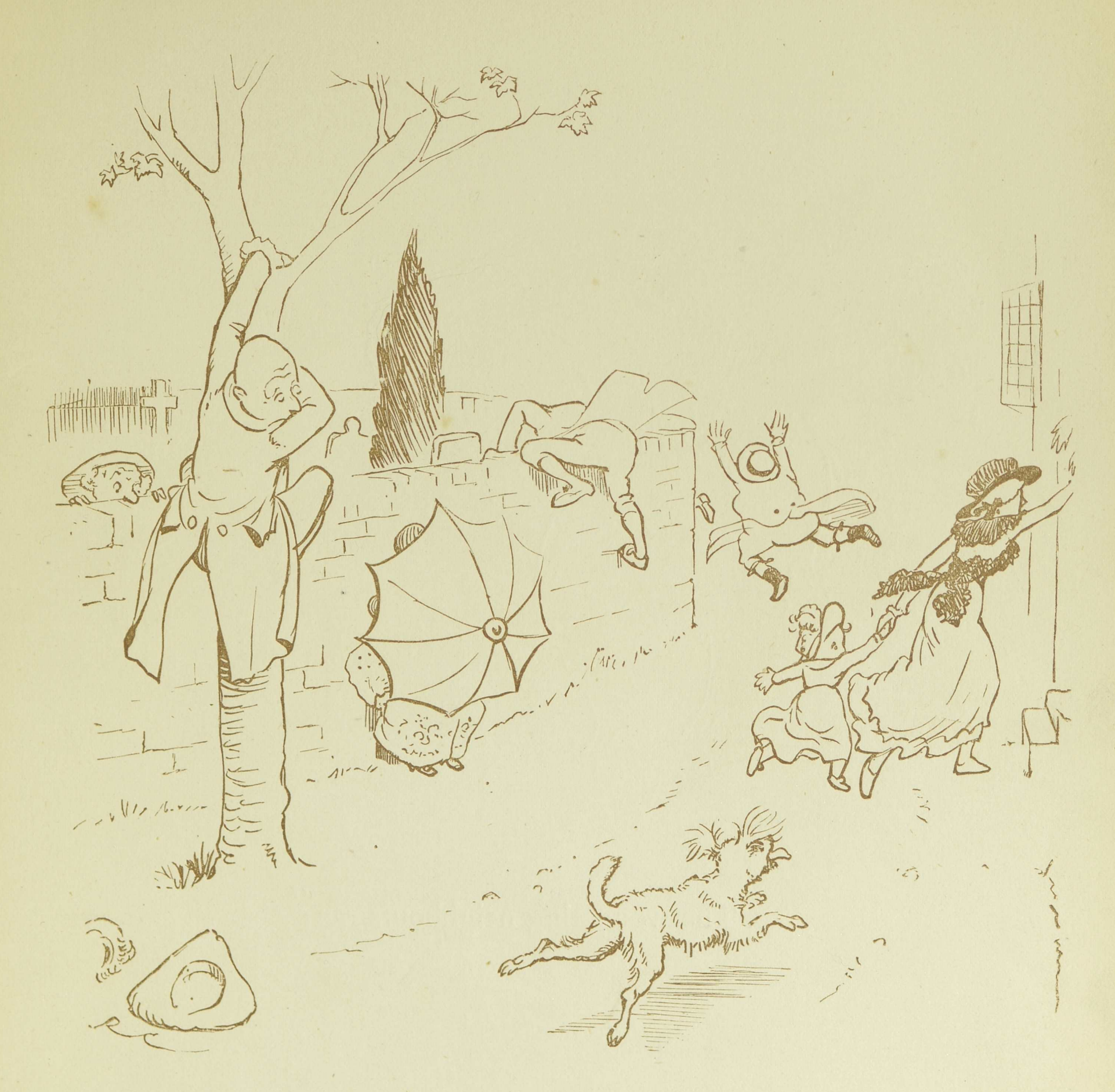
the neighbouring streets