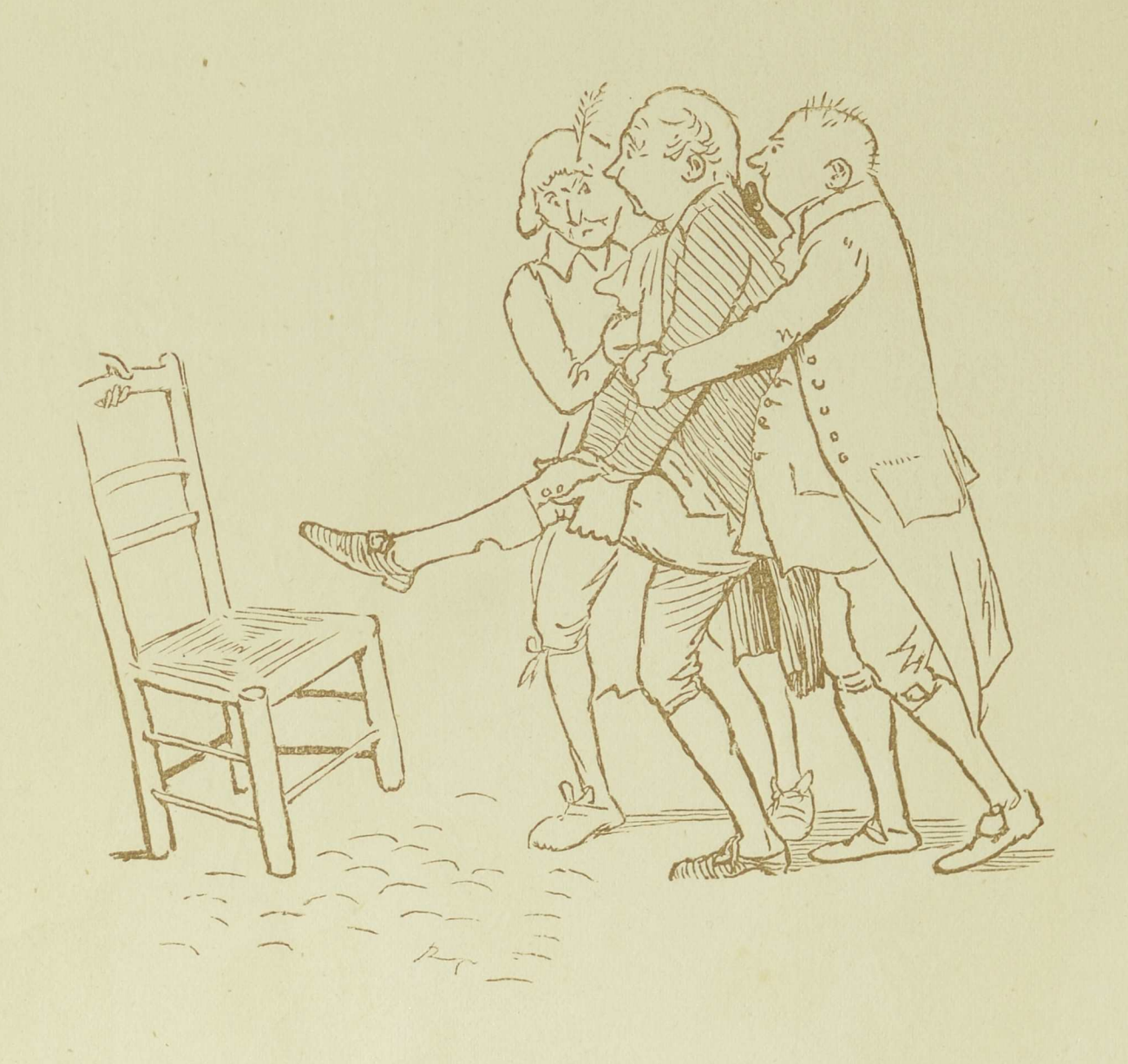
The wound it seem'd both sore and sad To every christian eye;