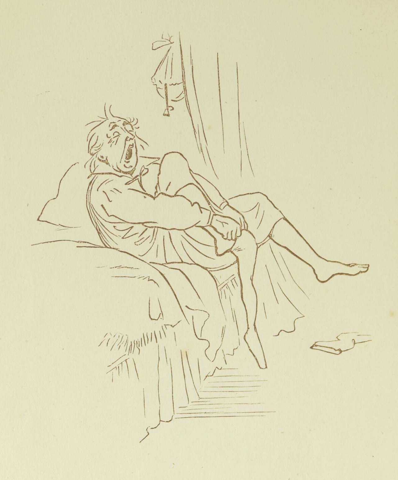
When he put on