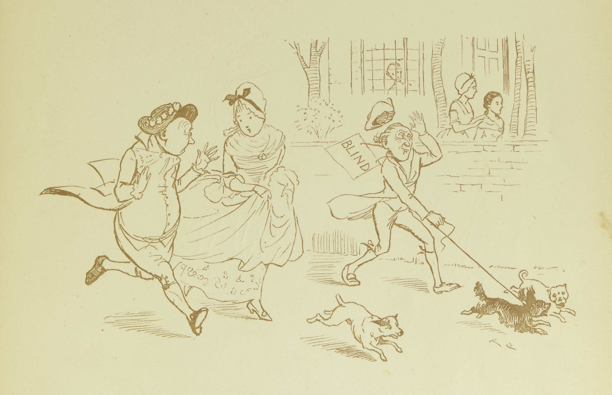
To bite so good a man.