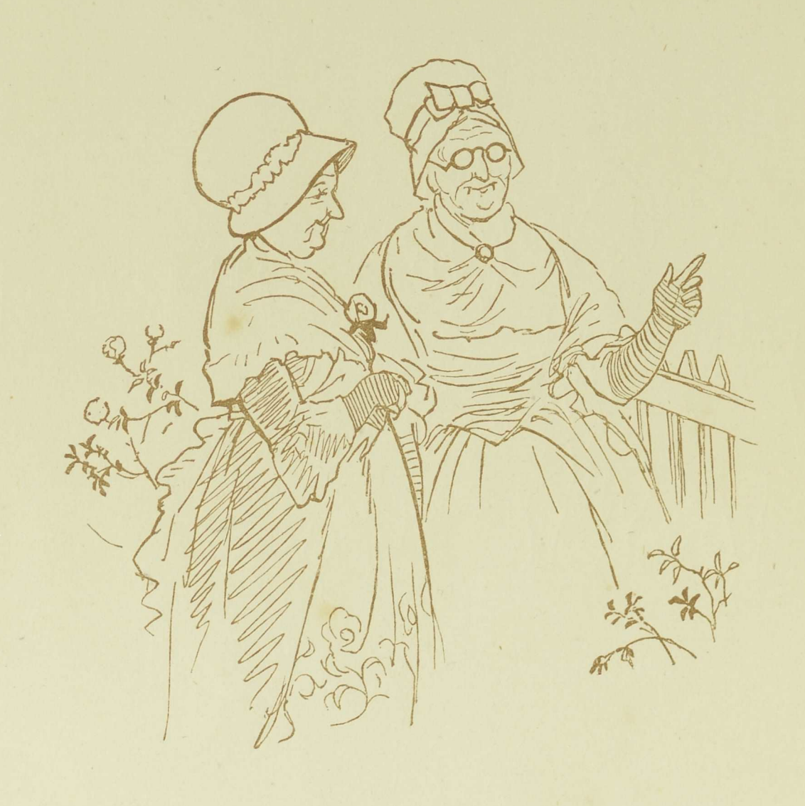
Whene'er he went