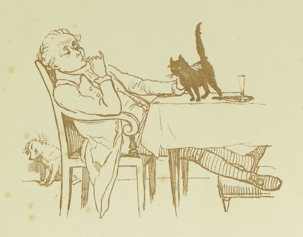
But, when a pique began,