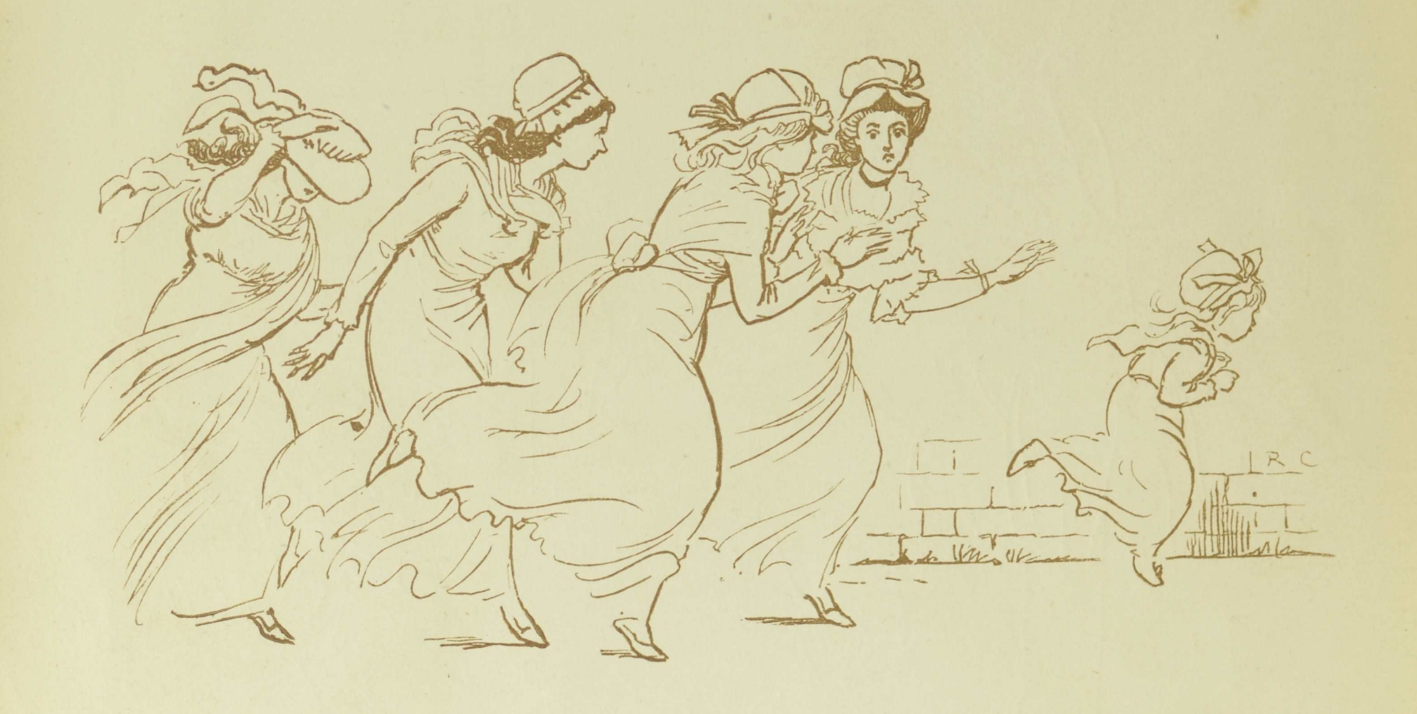
The wondering neighbours ran;