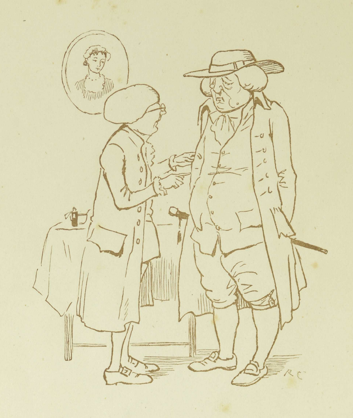
And while they swore the dog was mad,