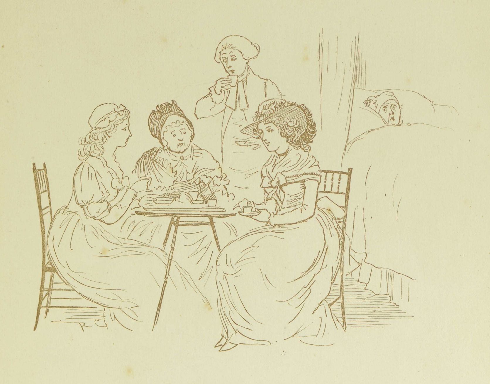
They swore the man would die.