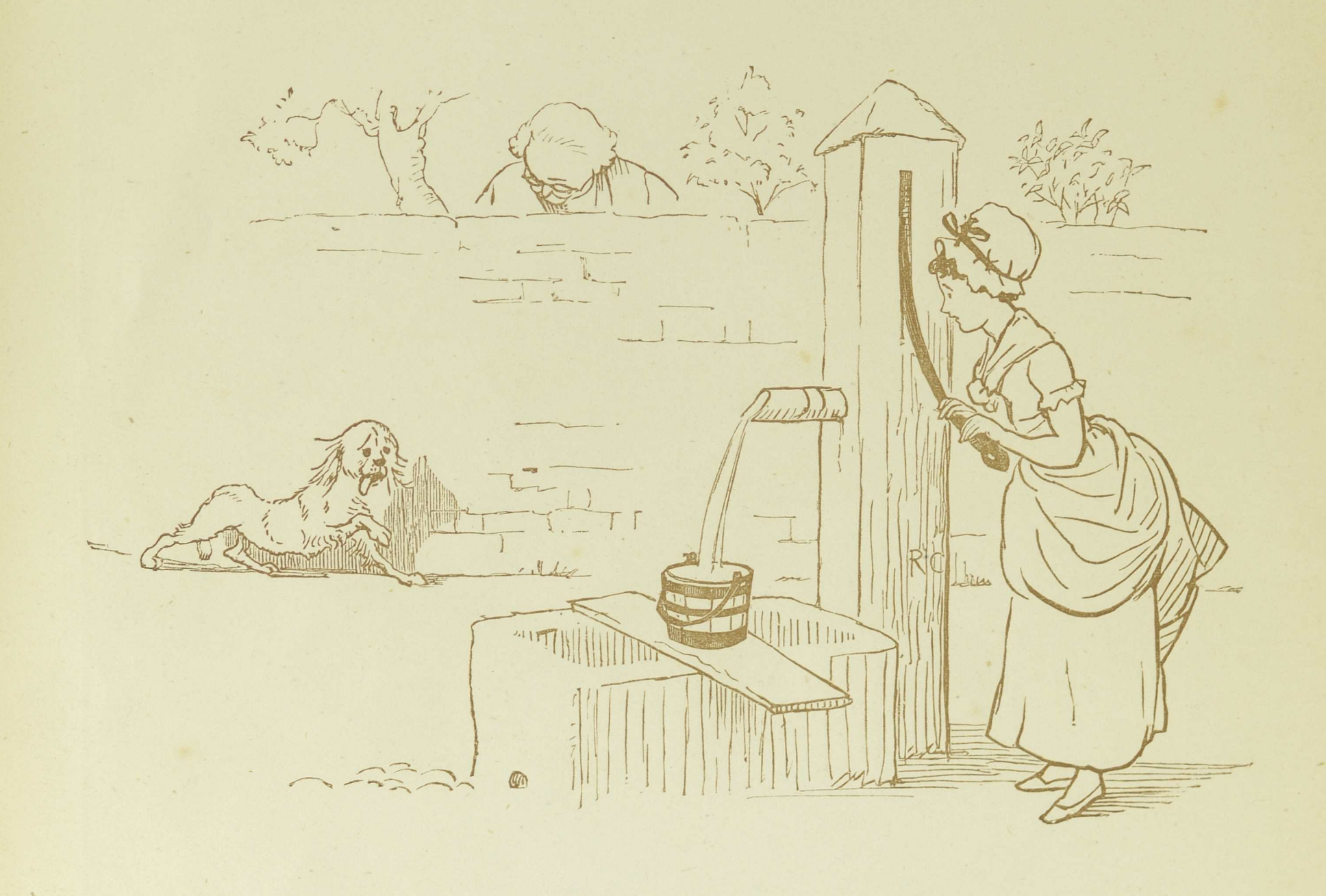
Around from all