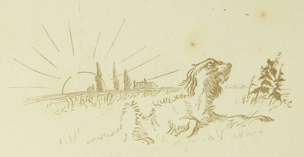
The dog it was that died.