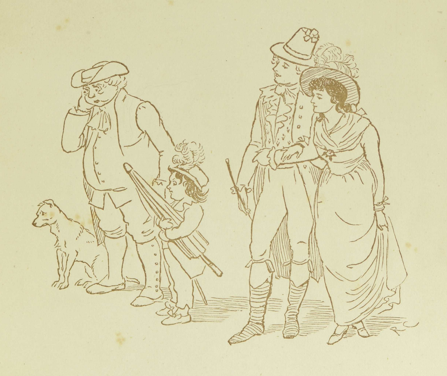
It cannot hold you long.