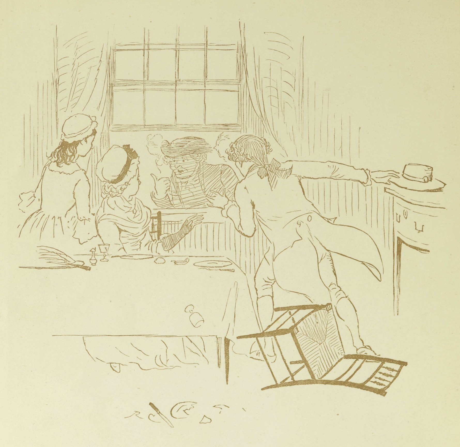
And swore the dog had lost his wits,