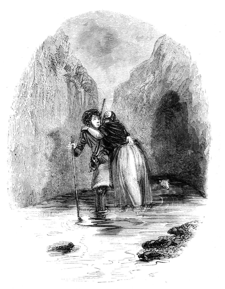
FORDING THE CANON.