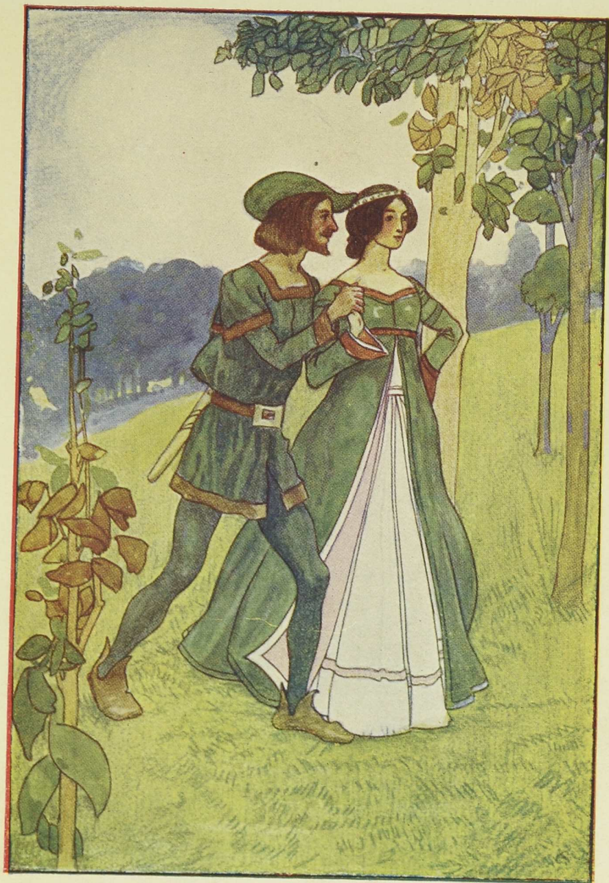
Slowly they paced through the Green Wood