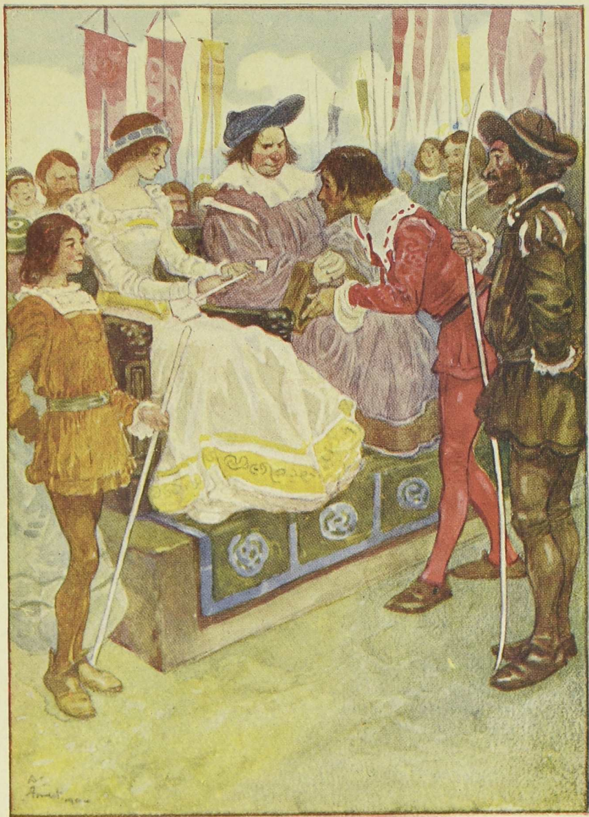
The Sheriff's wife, who presented him with the arrow