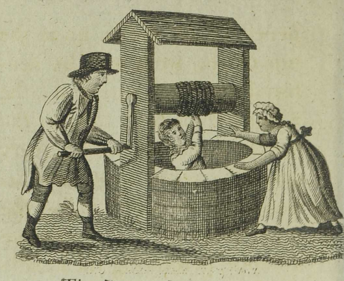
The Boy and the Bucket.

Inacountry village, some few years since, there was a well upon the common, for the use of the inhabitants: a little boy, on a visit to his friends there, and to whom a well was a new thing, went with his sister to see it: the bucket, at that time, hap-