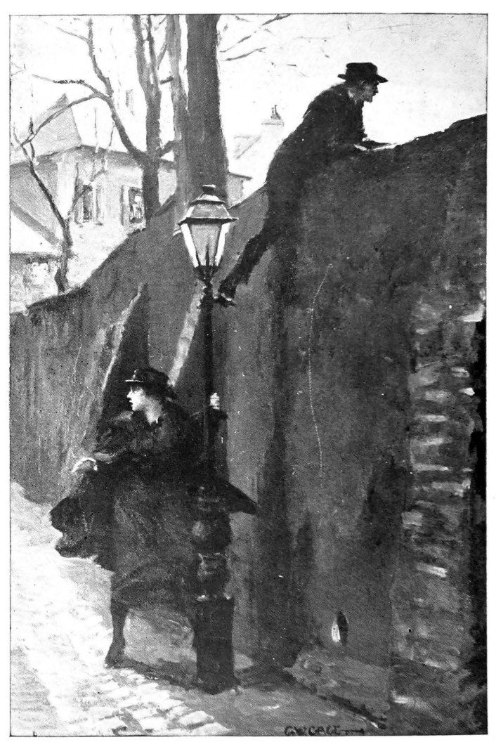
Bérangère stopped. (The Three Eyes)