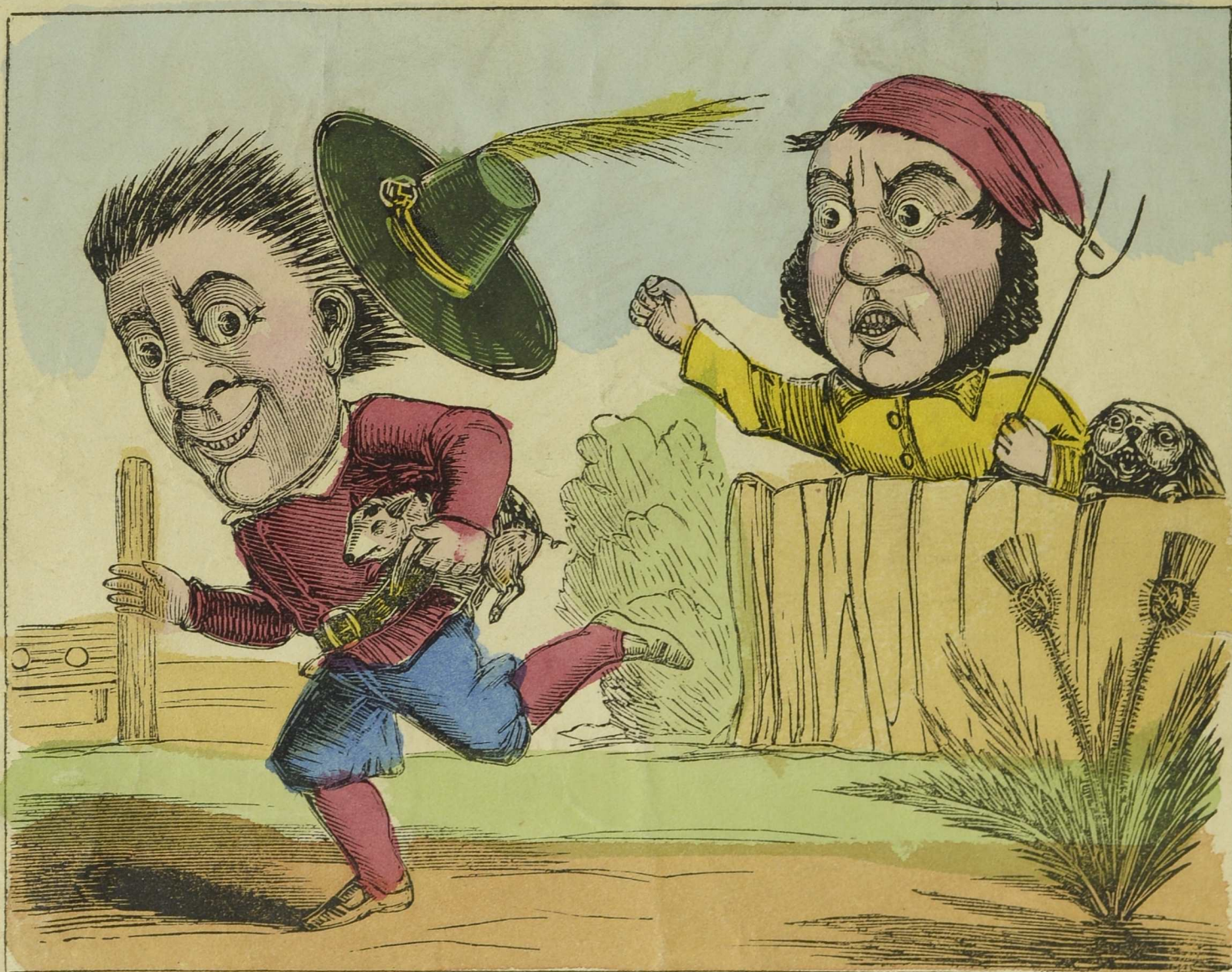
TOM STEALS THE PIG, AND AWAY HE RUNS.

Tom, he was a piper's son, And learned to play when he was young ; But the only tune that he could play Was "Over the hills and far away."