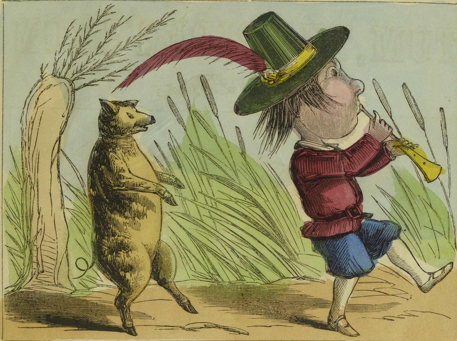
TOM CAUSES THE SLEEPY PIG TO DANCE.

Here is a long tailed pig, or a short tailed pig,