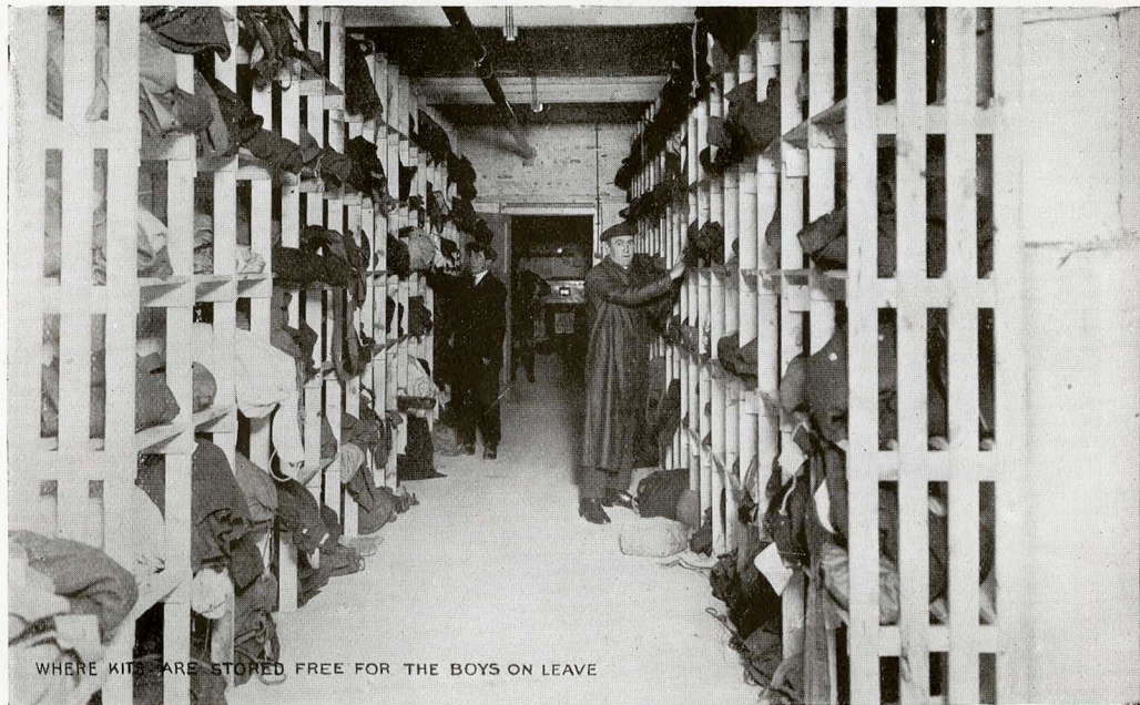
WHERE KITS ARE STORED FREE FOR THE BOYS ON LEAVE