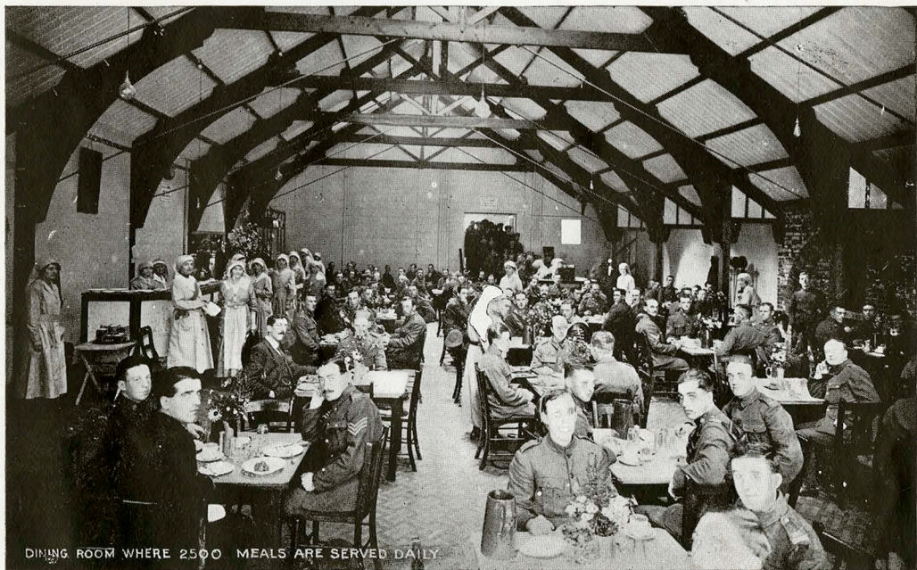
DINING ROOM WHERE 2500 MEALS ARE SERVED DAILY