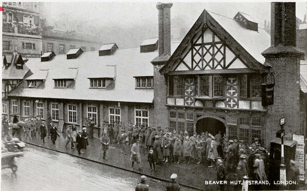
BEAVER HUT, STRAND, LONDON.