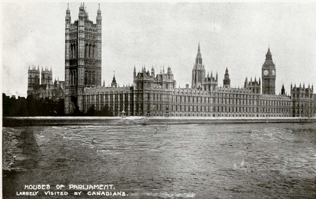
HOUSES OF PARLIAMENT. LARGELY VISITED BY CANADIANS.