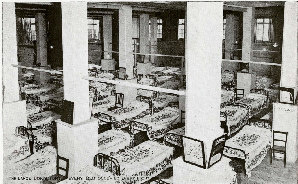
THE LARGE DORMITORY EVERY BED OCCUPIED EVERY NIGHT