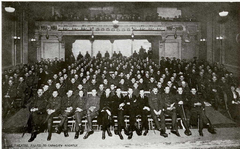
THE THEATRE FILLED TO CAPACITY NIGHTLY