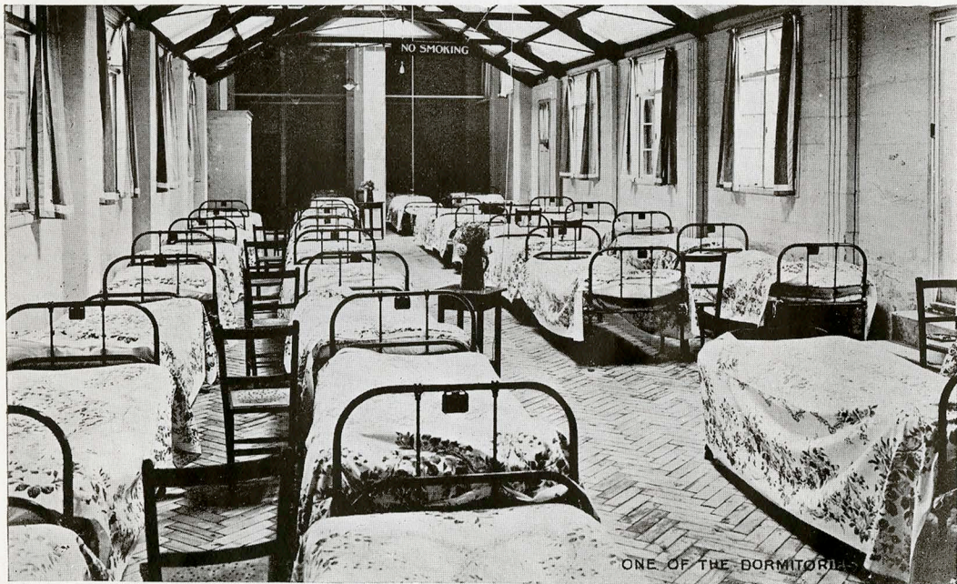
ONE OF THE DORMITORIES