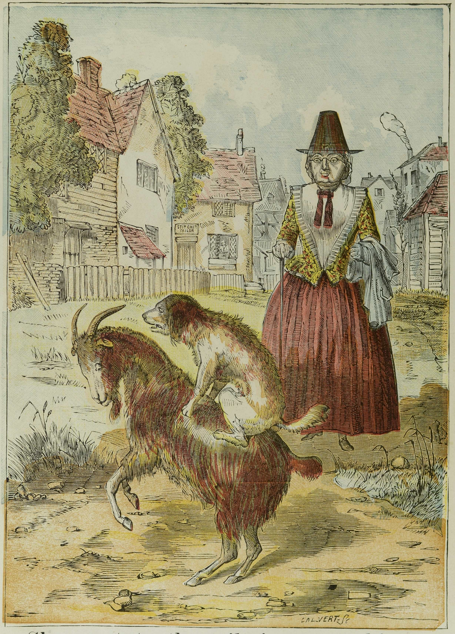
She went to the tailor's, to get him a coat;

When she came back, he was riding the goat.