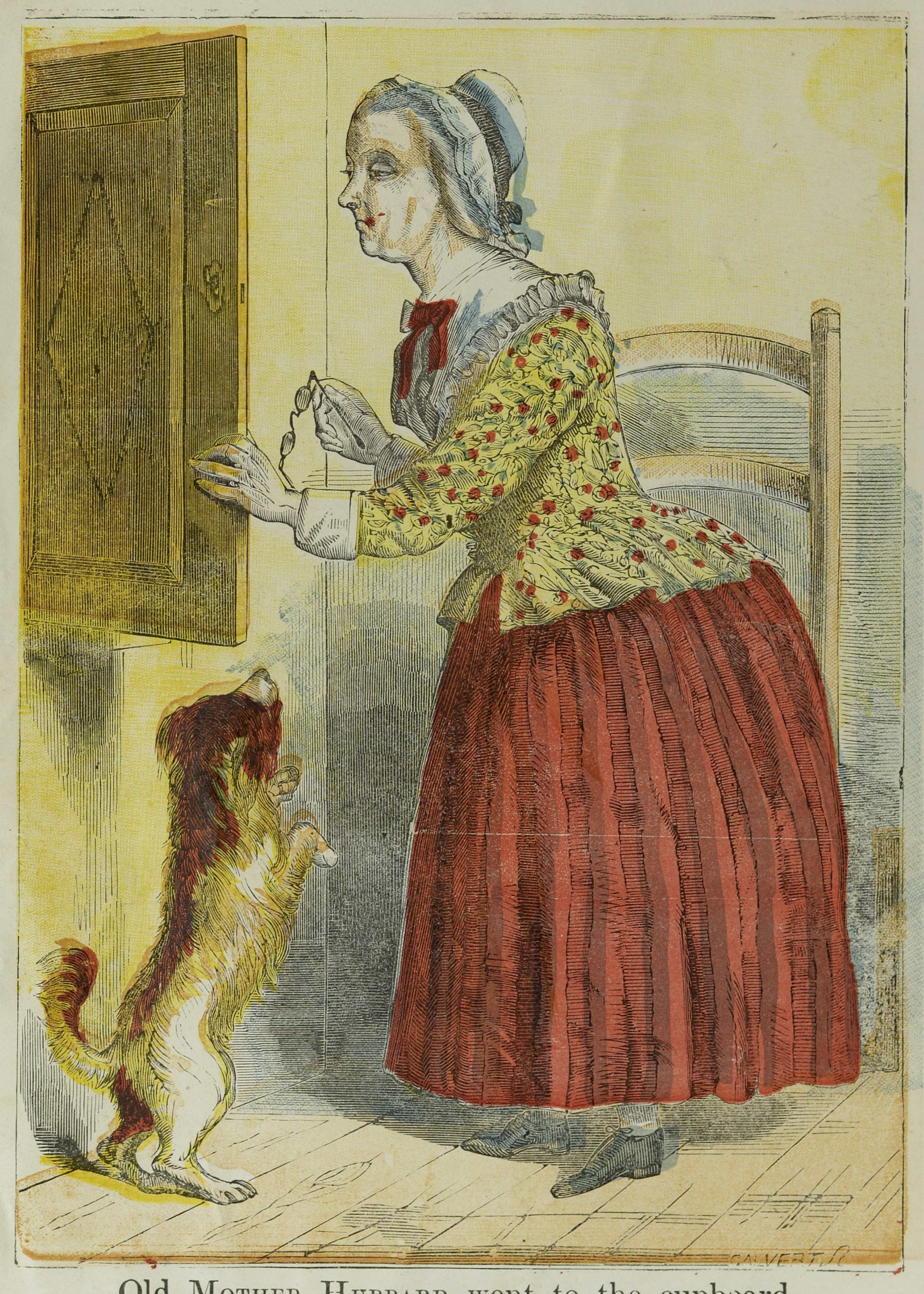
Old Mother Hubbard went to the cupboard, To get her poor dog a bone; When she got there the cupboard was bare, And so the poor dog had none.