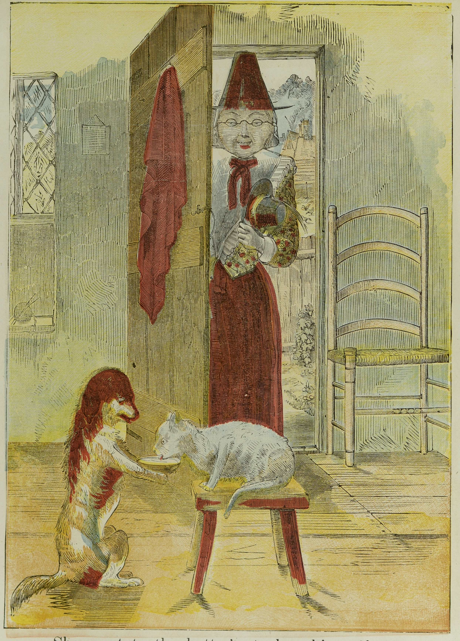
She went to the hatter's, to buy him a hat; When she came back, he was feeding the cat.

She went to the barber's, to buy him a wig; When she came back, he was dancing a jig.