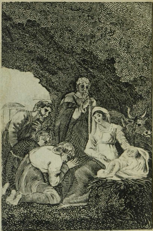
The Birth of Christ