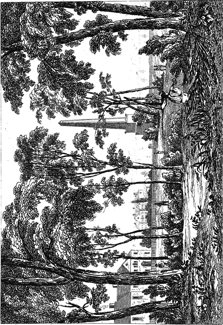
Wolfe's and Montcalm's Monument.