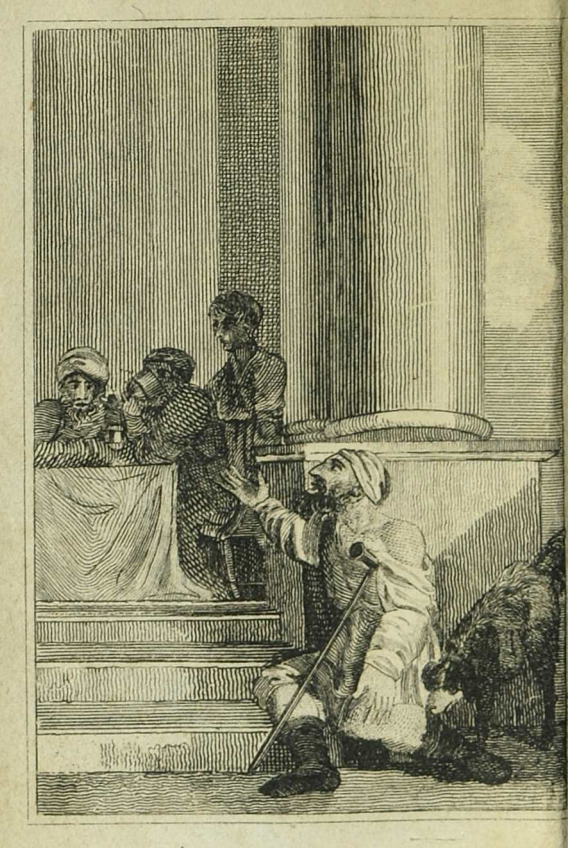
The Rich Man & Lazarus