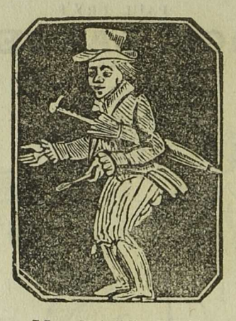
Mr. PAUL PRY.

Good morning my little dears— I hope I don't intrude—I believe you all know me—I'm the famous Mr. Paul Pry. Now, between you and I—I'vebeen on my travels, I'm not at all curious, you know; but when I saw anything very odd, or funny, I couldn'thelp packing it up so I've brought home such a collection—but I'm sure you'll all like to see it, and so here it is, packed up in my Magic Lantern.