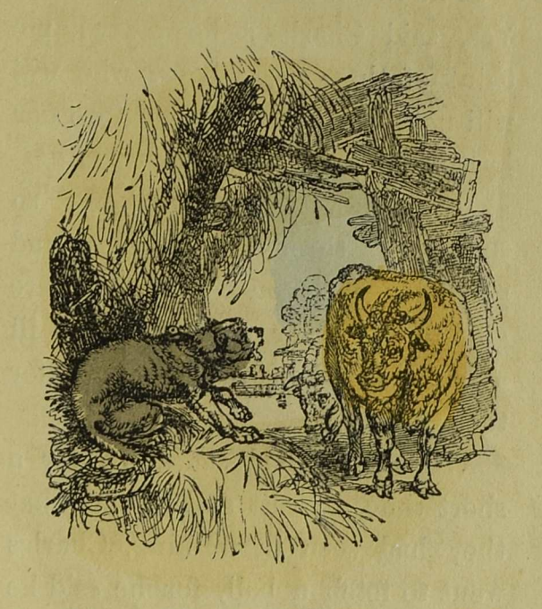
to do so, the dog gave a growl so

took a peep in, and there lay a large dog on some loose hay; he would not let the ox come in, for as he went