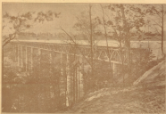
East York Houses