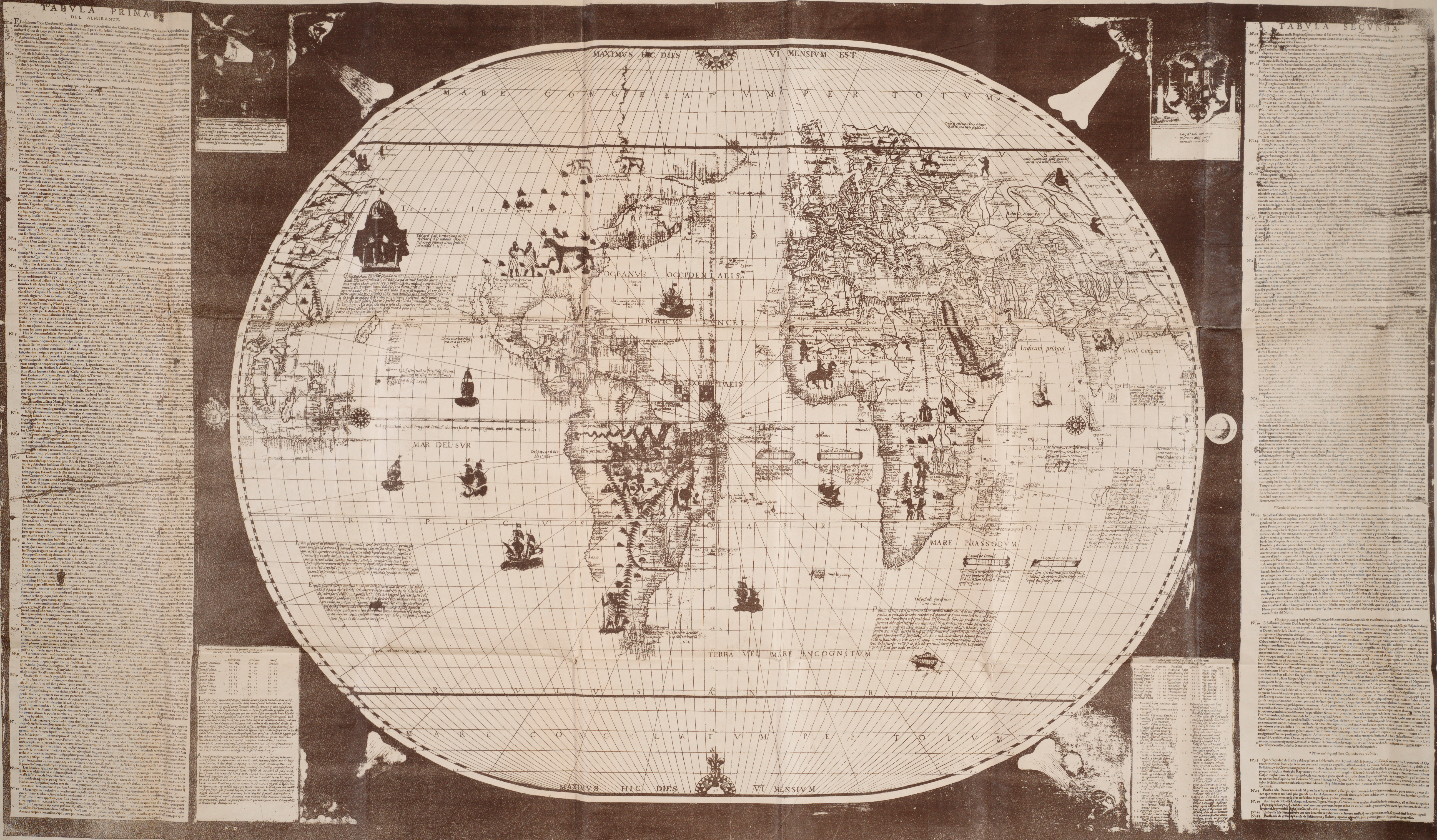
WORLD MAP OF A. D. 1544. (The Sebastian-Cabot Map.)

Reduced by Photography to a little less than half-size. From a negative taken from the original at Paris by order of the Minister of Agriculture and Statistics.