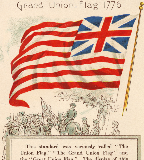
Grand Union Flag 1776

This standard was variously called "The Union Flag," "The Grand Union Flag" and the "Great Union Flag." The display of this standard before Washington's Army marked an era in the affairs of the Colonies, as it was the first to be raised that symbolized the union of the Thirteen Colonies.