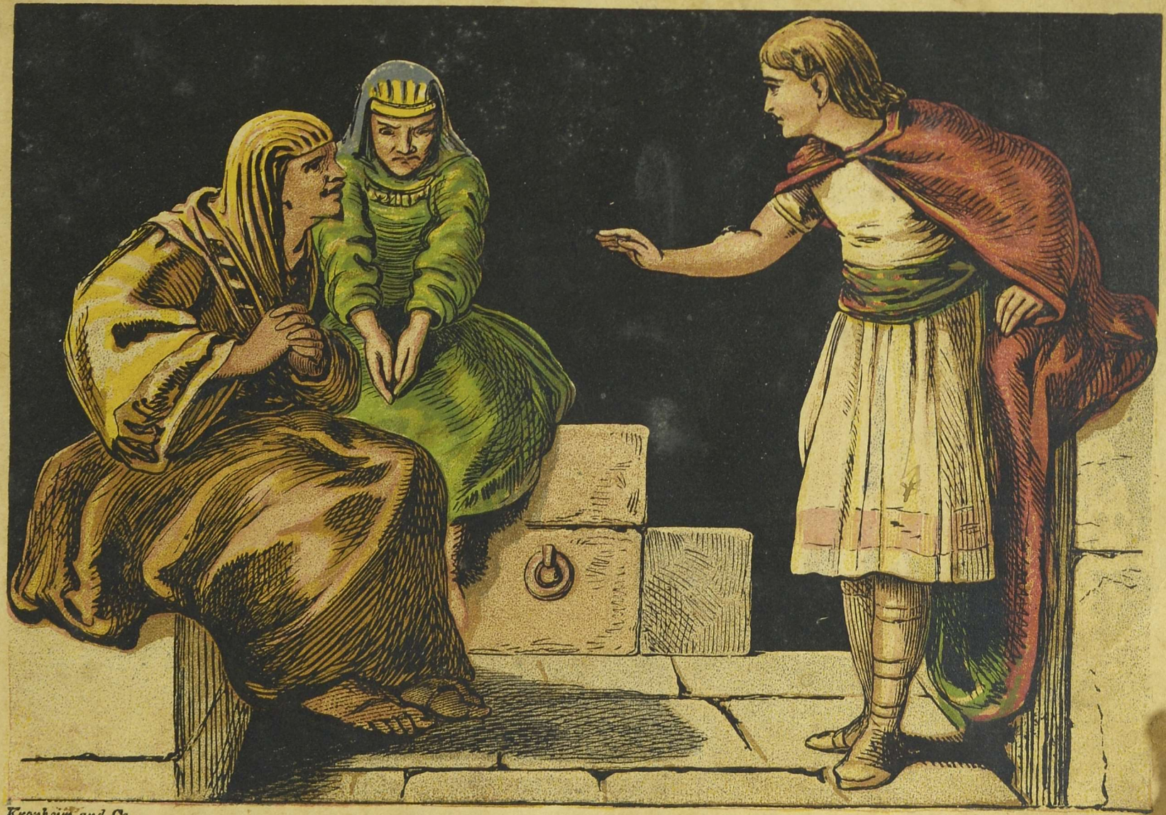
Kronheim and Co.,