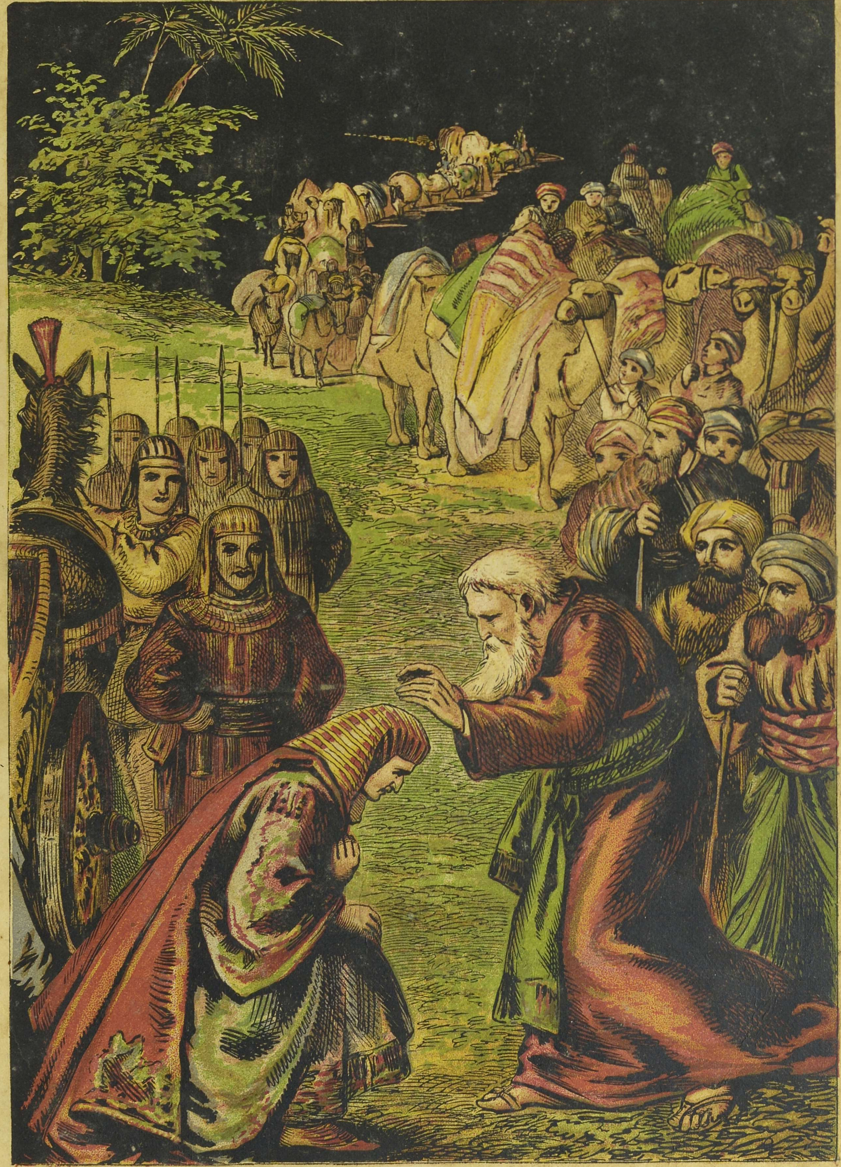
bronheim and Co.