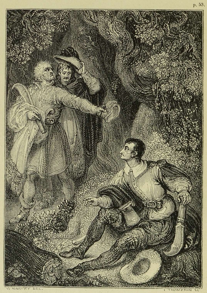
CHARLES THE SECOND IN THE WOOD AT BOSCOBEL.