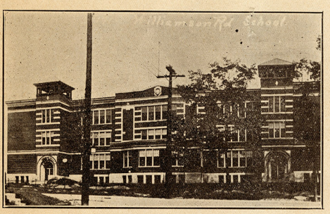
WILLIAMSON ROAD SCHOOL

There are very few homes in the Beach that are not fitted with a piano few families who have not some one who can play the king of musical instruments. It has been comparatively few years since the piano became a factor in home furnishing, but to-day the modern and up-to-date house is not complete without it. The parties re-sponsible for this are first the makers of the pianos, next—and they should be first —the men who sell them. There is always a temptation to sell a cheap piano, but quality tells, and to this fact is due possession, in the majority of the finest homes in the Beach district of the sterling instruments made by the Nordheimer Piano Co. whose agent in this section is known as J E. Spears & Co. They occupy an attrac-tive store at 2201 Queen Street East, phone Beach 1299, which is fitted with every convenience. This business was establish-ed here in August, 1915. This firm are also dealers in Heintzman gramaphones, Victor records, magazines, stationery, etc. E. Spears & Co. are thoroughly experienced in this line of commercial enterprise, and have built up a clientage that is a credit fied with the best interests of this section and possess a host of personal friends.