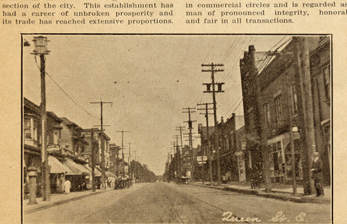
QUEEN STREET, LOOKING EAST FROM LEE AVENUE