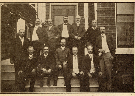
FIRST TOWN COUNCIL, EAST TORONTO

pass through East Toronto, also the Scarboro division of Radial Railway at the Woodbine leaving for West Hill, making connections with King Street cars at Kingston Road.