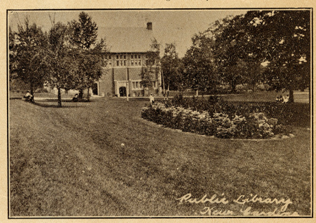
PUBLIC LIBRARY KEW BEACH