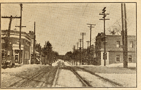
QUEEN STREET, LOOKING EAST FROM QUEEN & BEACH AVENUE

low Grove creamery butter and fresh laid eggs direct from the farm. The stock handled will compare favorably with that of any store in this locality. The premises occupied are located at 2238 Queen Street East next to Prince Edward Theatre, phone Beach 2392. They embrace a store neatly