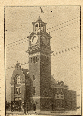
KEW BEACH FIRE HALL