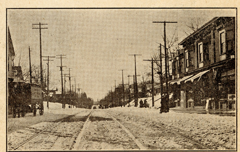
QUEEN STREET, LOOKING WEST FROM QUEEN & BEACH AVENUE