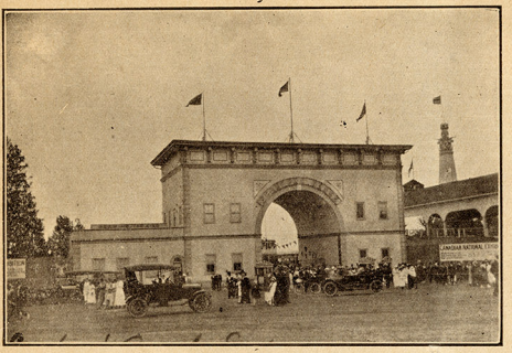
SCARBORO BEACH ENTRANCE

sage, poultry, game, hog products, butter, eggs, all kinds of vegetables, all of the choicest grades. The management is very careful in the selection of its meats, and gives its personal attention to all details, so customers are sure of receiving only the best meat products on the markets. As this