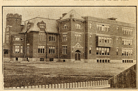
MALVERN AVENUE COLLEGIATE INSTITUTE C. Lehmann, Principal

Pleasure Boat Waterway. Behind the boulevard a system of channels and lagoons, connected with the natural lagoons through the Island, will provide a protected waterway of 13 miles for small pleasure boats across the entire city front and opening into the Humber River on the west.