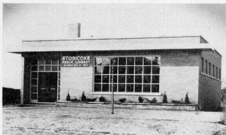
HUMBER BAY LIBRARY, Park Lawn Rd.