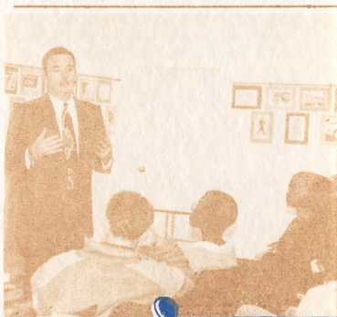
Michael Blake, Academy Award winning author of Dances With Wolves talks with Runnymede Collegiate students at the Jane-Dundas Branch.