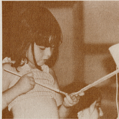
Crafts are among the many absorbing programs for children.