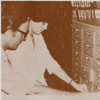
Just ask. Librarians are there to help you find what you need.