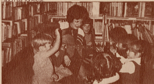
Pre-School Story Times are held regularly in all branches.