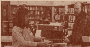
Many of you enjoyed borrowing books from our libraries. We enjoyed serving you