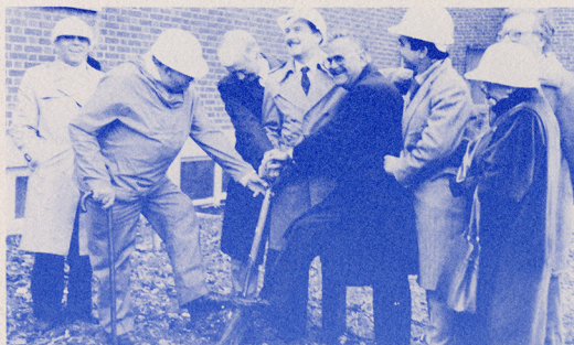
Politicians, Library Board Members and patrons gathered for the Groundbreaking Ceremony at Mt. Dennis Branch on Monday, December 3, 1984.