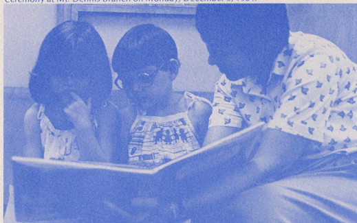
Reading is fun especially when shared with a friend.