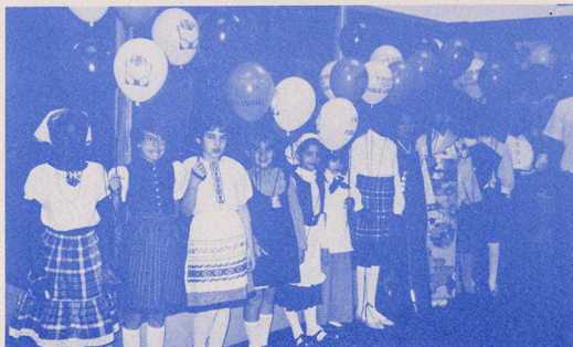
Wearing their ethnic costumes, these children sang in a choir for International Night, 1984.