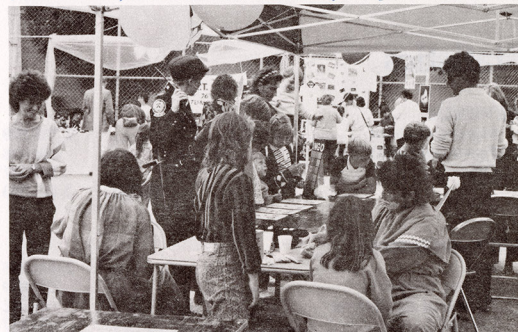
Library bingo and face-painting were popular at the Mt. Dennis Fall Fair.