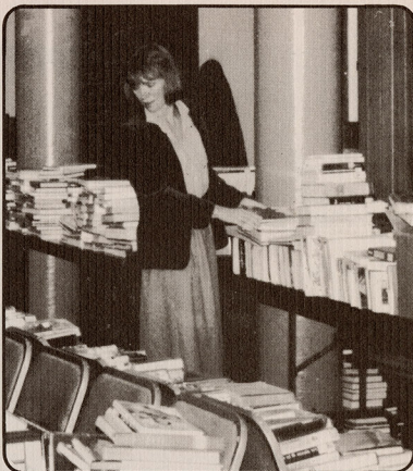
A major withdrawal of worn-out and read-out books was completed in '87, in preparation for upcoming automation.