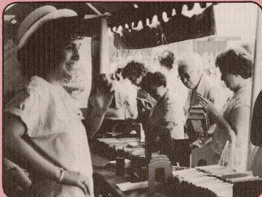
Our annual Canada Day celebration, complete with puppet shows, local history displays and a giant paperback sale, is a happy East York tradition.