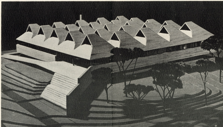
Model of Cedarbrae Regional Library