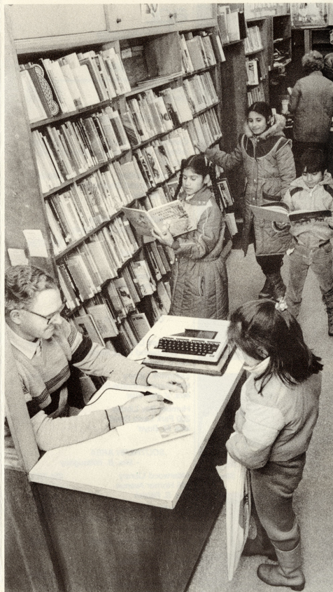
The Bookmobile, library service on wheels

The year 1985 witnessed the proclamation of a new Public Libraries Act for Ontario, thus marking the first major legislative review since 1970. It is anticipated that increased representation from City Council on the Library Board will provide more opportunity for dialogue and information exchange for the years ahead.