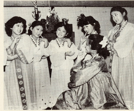
4. MULTICULTURAL PROGRAMMES