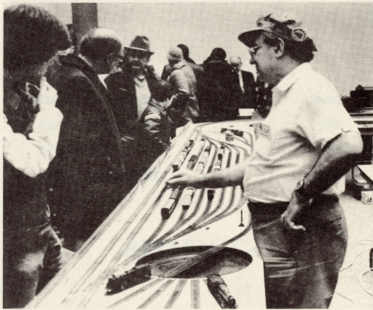
2. 7th ANNUAL MODEL RAILROAD SHOW