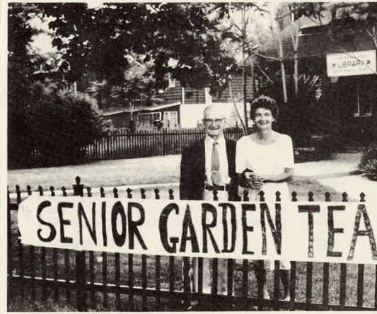
3. SENIOR CITIZENS' WEEK