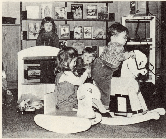
1. NEW TOY LENDING SERVICE