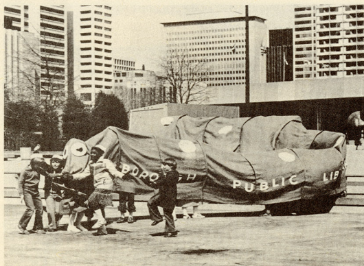
5. PUBLIC LIBRARY WEEK - SCARBOROUGH PUBLIC LIBRARY BOOKWORM