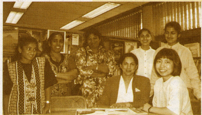
Students and staff of the English Can Be Fun program at Cedarbrae District Library.

One of the Library Board's key service objectives has been to take advantage of computer technology to enhance customer service. Installation of software which enables customers to renew materials by touch-tone® telephone has assisted people whose busy schedules or limited mobility makes it difficult to get to the library in person. At Cedarbrae District Library, a job bank database, provided in co-operation with the Department of Human Resources Development Canada, has been a popular addition to public library service.