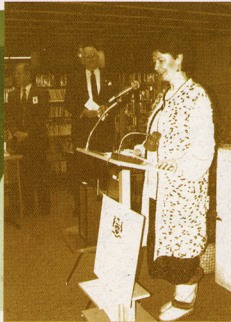
The Honourable Anne Swarbrick, Minister of Culture, Tourism and Recreation at the launch of Online Ontario Government Service at Albert Campbell District Library.