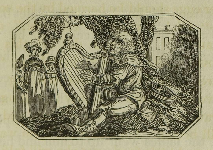
THE WELCH HARPER.

From the court-yard a wicket led into a green wooded lane, and as the three rambled forth, careless whither they roved, sure of finding beauty in all around, they came at a turn of the path in view of a strange object. It was a very old man, seated beneath an