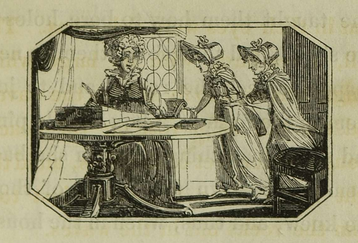
THE GIRLS AT HOME.

THE Aunt was at her desk when they went home, and she told them how to dry the weeds, and clean the shells; she told them too how to fix the weeds to boards with gum, and thus to make a kind of groupe of trees and shrubs.