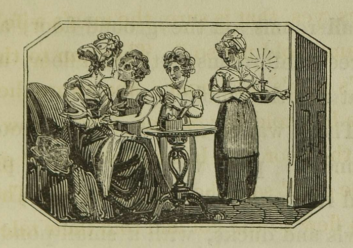
A KISS AND GOOD NIGHT.

By the time the tale was done, and the laugh was done, it was the hour to go to bed, and the maid came with a light for the young girls. They each gave a kiss and a kind good night to their dear friend, and ran off to their own snug room. The cot had but three