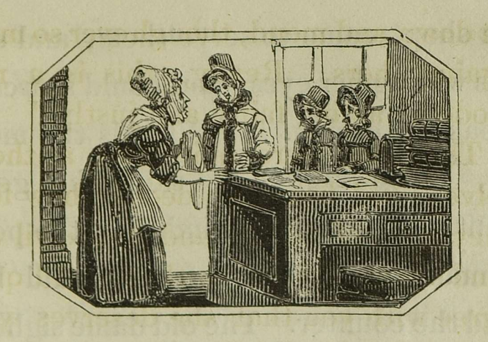
THE VILLAGE SHOP.

Now Blanche was well again; they all walked to Lord Glenmore's, and he kindly gave his promise to employ the poor man in his gardens or grounds. As they came back they called in at the village shop to buy some things for the poor man. The old woman, who kept