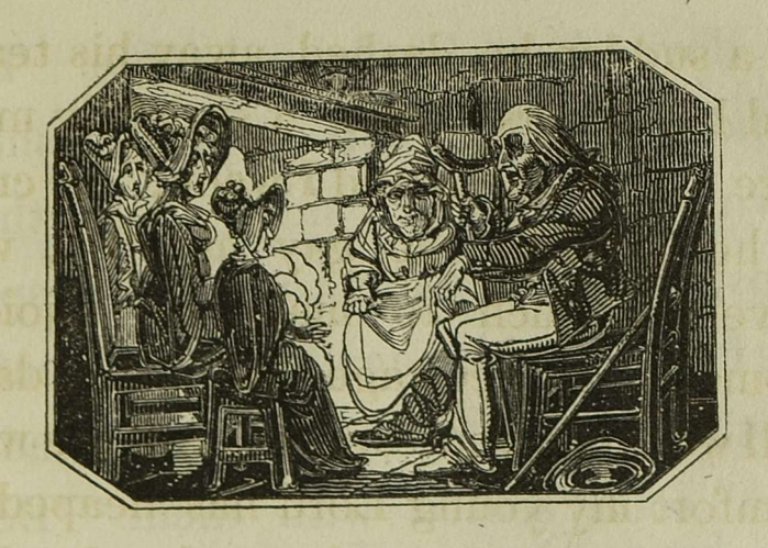
THE HARPER'S COTTAGE.

The ladies did not forget the old harper; and not many days passed before they sallied forth to search for his lowly cottage. They wound through the mazes of the wood, treading on dry leaves and crackling boughs, and scaring the squirrel from its nook, and