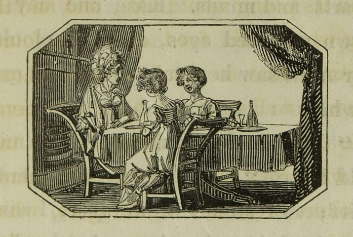
TEARS OF JOY.

At noon as they sat at their plain meal, for in Wales they do not keep such late hours as we do in town, the three would talk of all they had seen, or heard or felt. They did not care much what they ate—they thought more of their