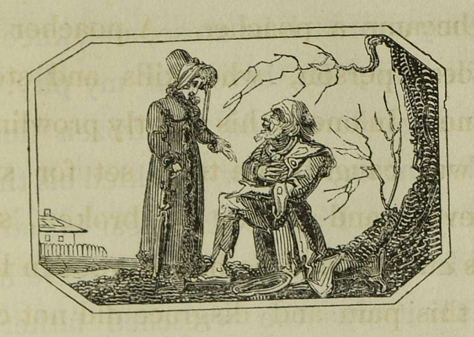
THE UNHAPPY FATHER.

"And now for the father's sad tale," added the good Aunt. "One very cold day last winter, when the ground was frozen hard, I went out to visit a sick child in the village. Crossing the heath on my return home, I saw, beneath a tree, the figure of an old man. On hear-