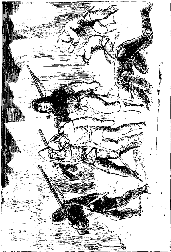
RETURN OF THE HUNTING PARTY.