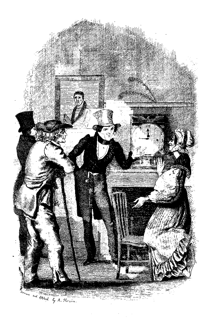
Soft Sander & human maturix