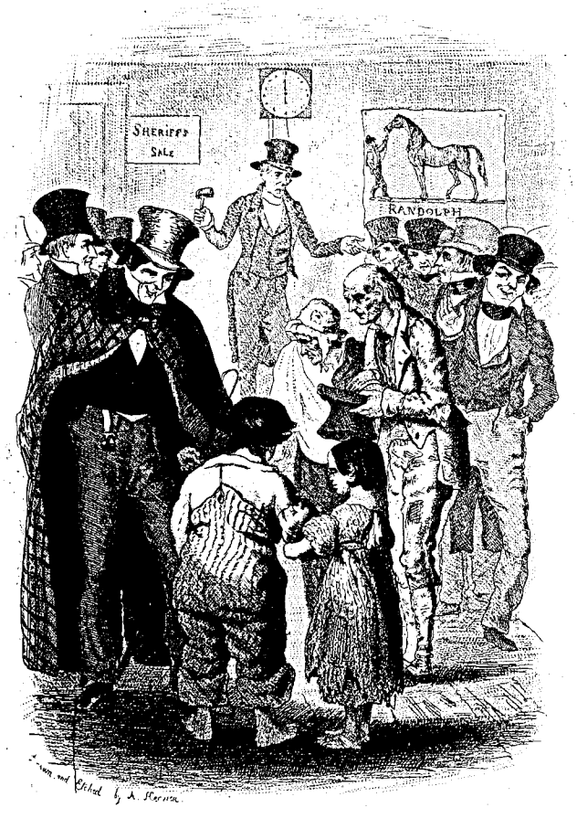
The White Niggers.