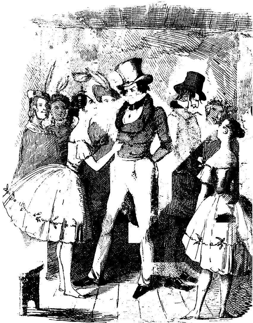
Behind the Scenes.