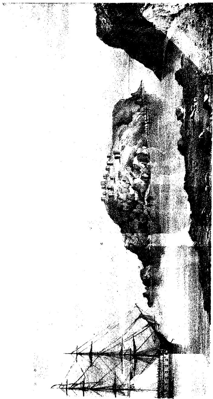
GOOD HARBOUR IN CANDIA.