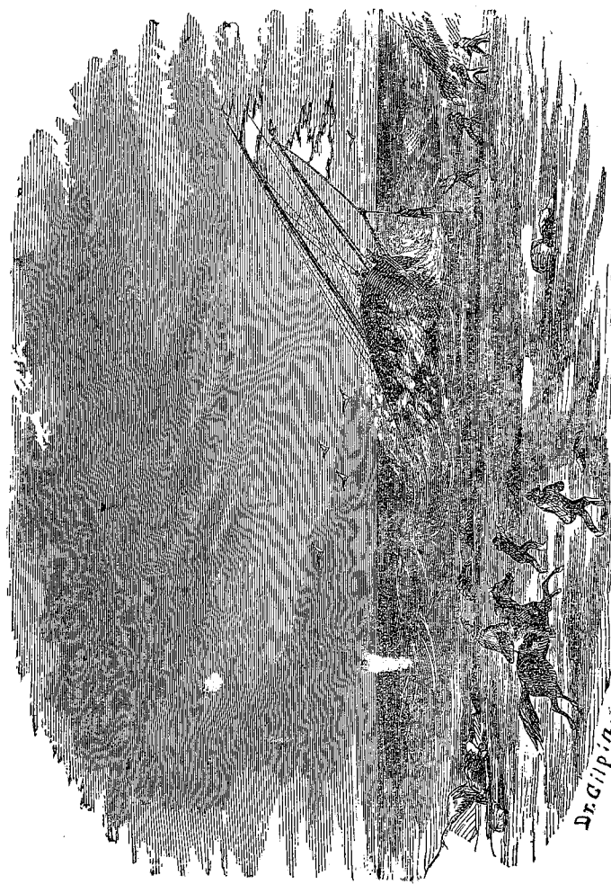
WRECK OF THE ARNO.