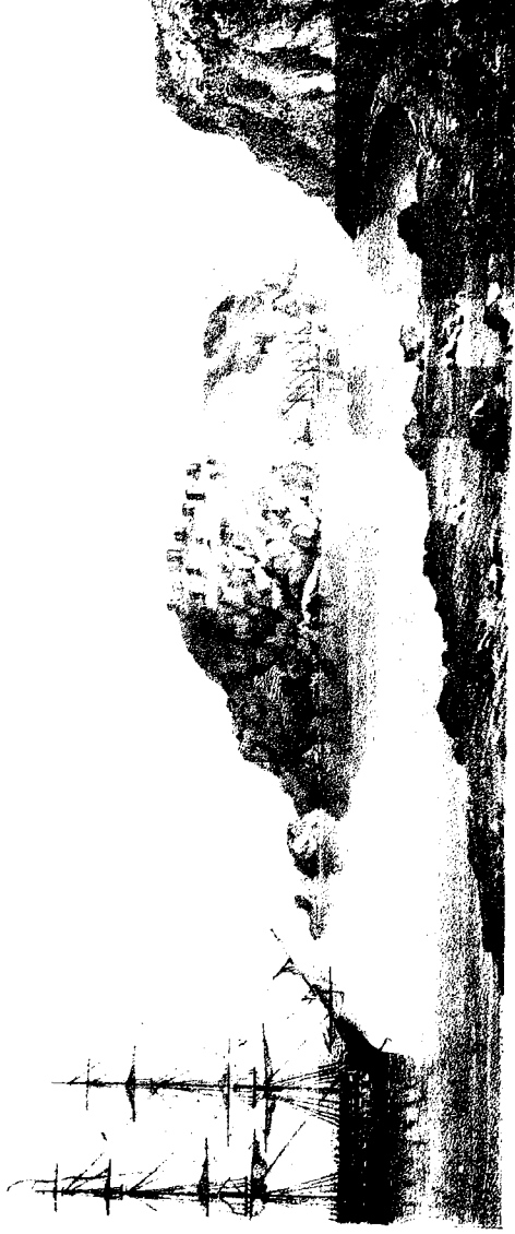
GOOD HARBOUR IN CANDIA.