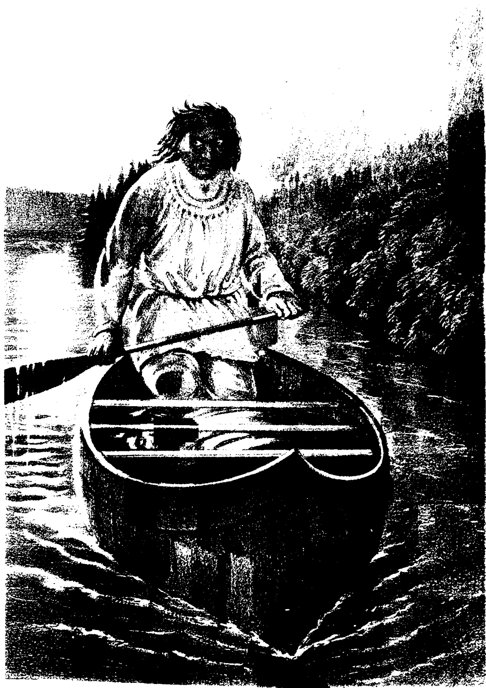
BOAT ON RIVER