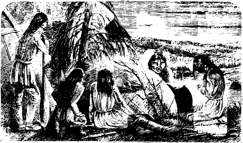
THE CONJUROR IN HIS VAPOUR-BATH.

The vapour-bath played an important part in their ceremonies : it was not only used for medicinal purposes, but in it the conjurors were accustomed to propitiate the deities, or Kichi-kouai, who presided over their hunting-grounds. The conjurors would frequently pretend to see the feeding haunts of the caribou or moose, the winter