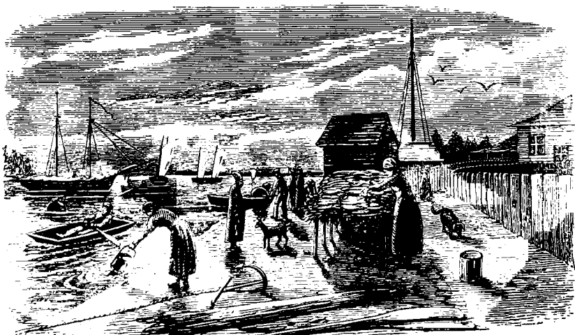
ESQUIMAUX POINT, LOOKING WEST.