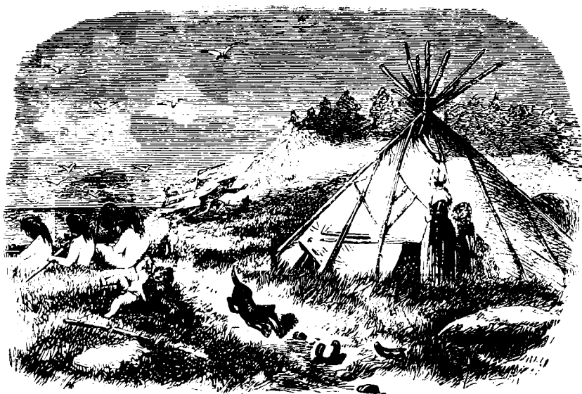
MONTAGNAIS CAMP ON ONE OF THE MINGAN ISLANDS.

I went with one of the clerks into the Hudson's Bay