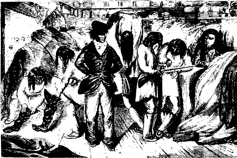
NASQUAPEE INDIANS AT THE HUDSON'S BAY COMPANY'S POST AT MINGAN.

The garments of the women consist of a square piece of dressed deer-skin, fastened round the body with a belt, and suspended from the shoulders by means of straps, a leather jacket, leggings, and moccasins. Polygamy is practised, and it is not unusual for a man to marry two sisters one after the other, or both at the same time. Whatever is killed in hunting or fishing is divided among