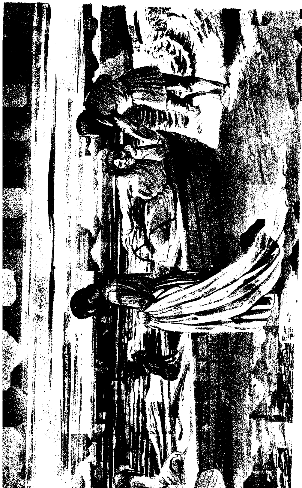
THE WINDING SHEET