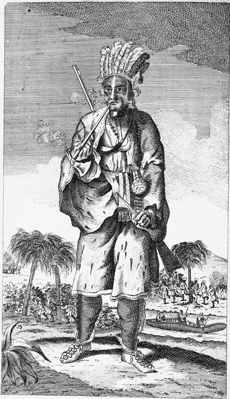
A Delaware Indian. with his Tomohawk Scalping knife &c.