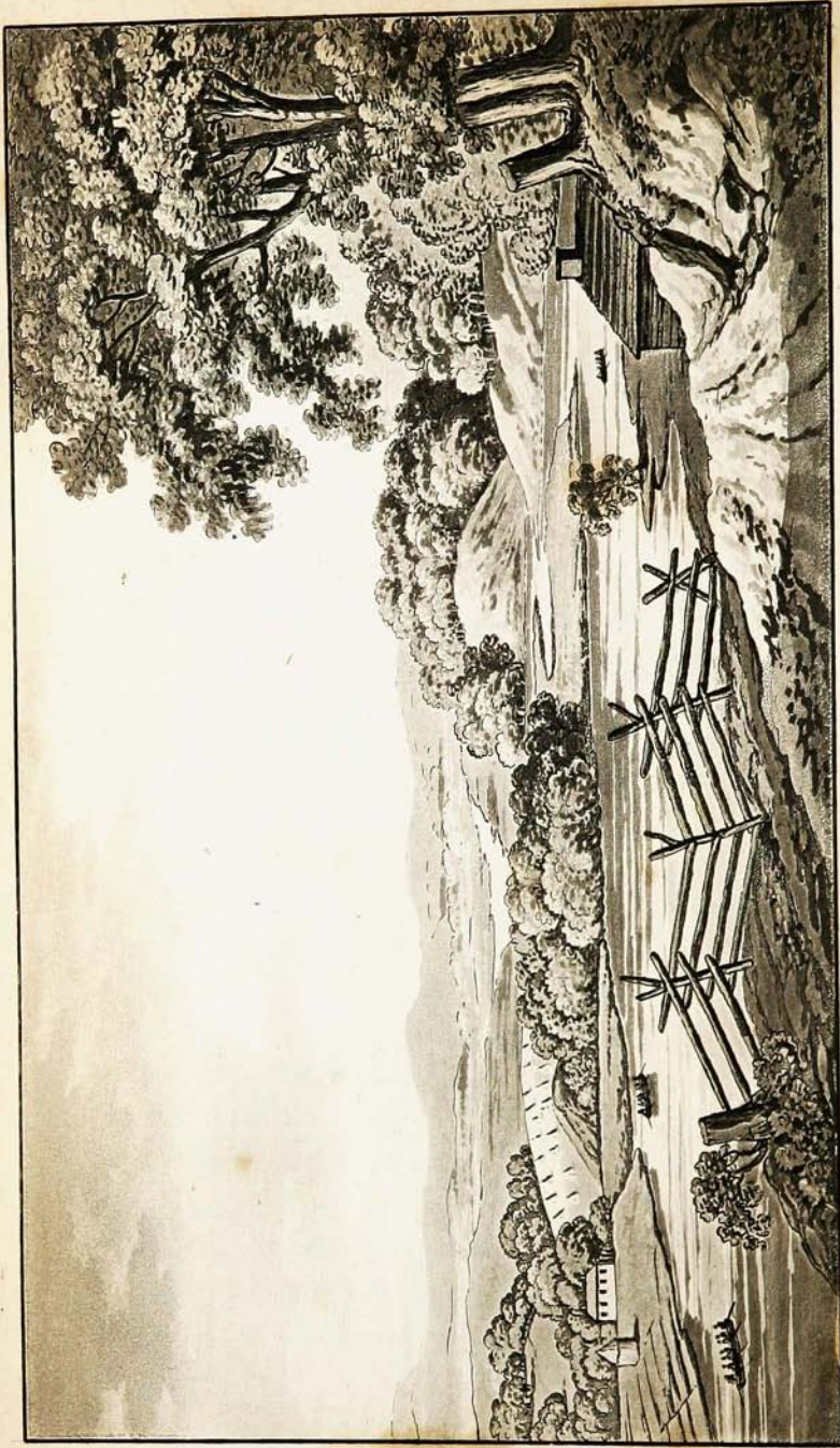
View of Gen. Burgoyne's Encampment at Saratoga at the Time of his Surrender to the Americans.