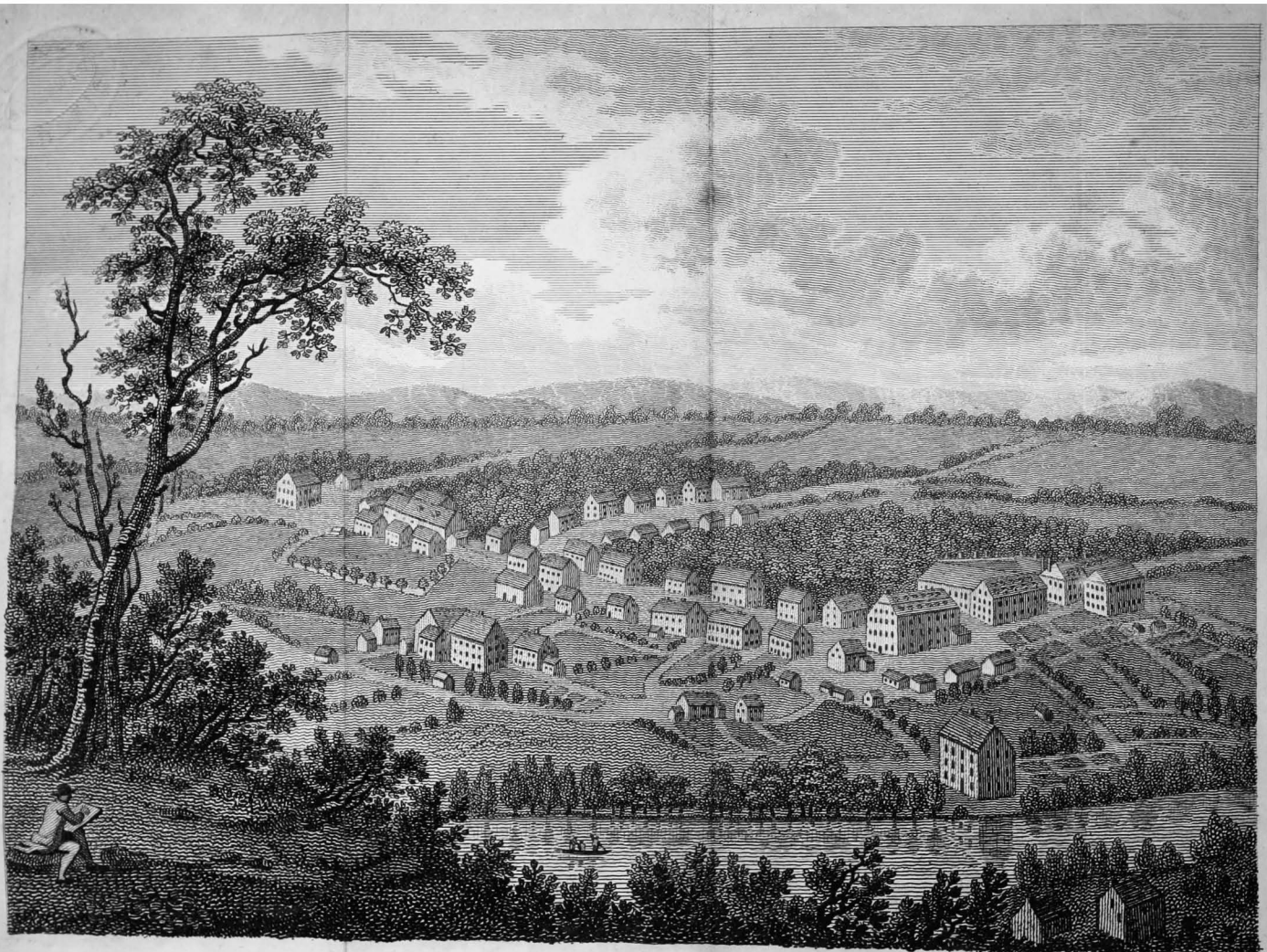
VIEW of BETHLEHEM a Moravian settlement.

Published Dec. 22. 1794. by I. Stockdale, Piccadilly.