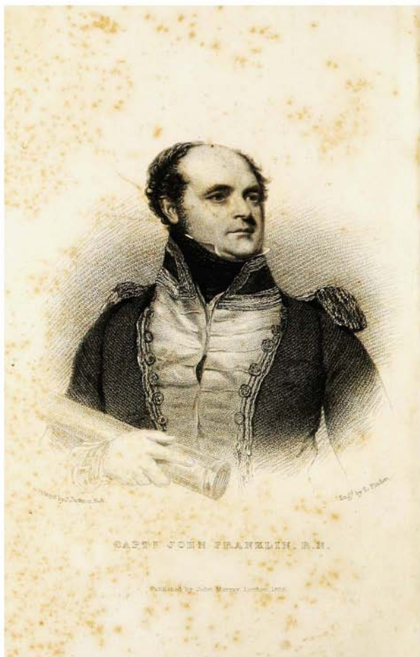
CAPTAIN JOHN FRANKLIN, R.N.