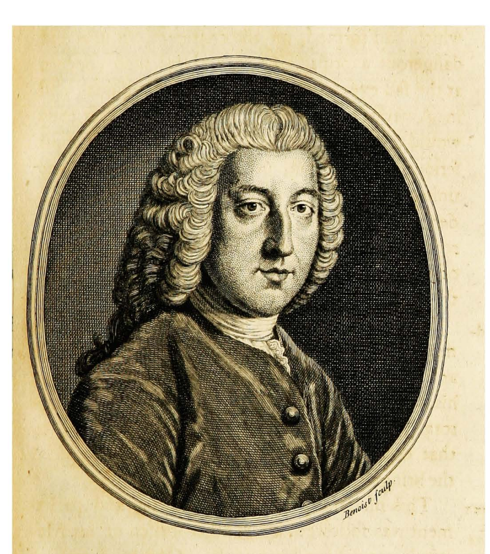
The Right Honbe WILLIAM PITT, Efq.