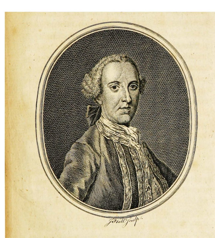
SIR PIERCY BRETT K.