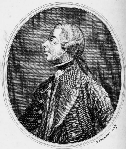
MAJOR GENERAL WOLFE.