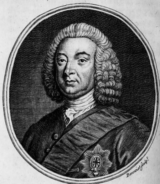
SIR EDW. d HAWKE Admiral of the White.