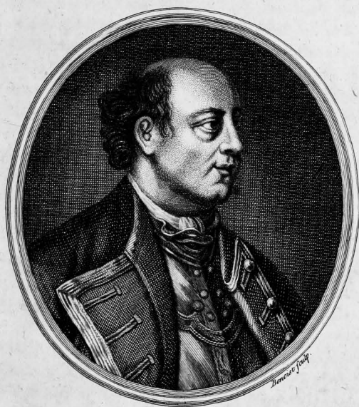
MARQUIS of GRANBY.