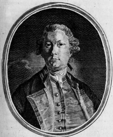
The Hon. ble AUGUSTUS HERVEY.