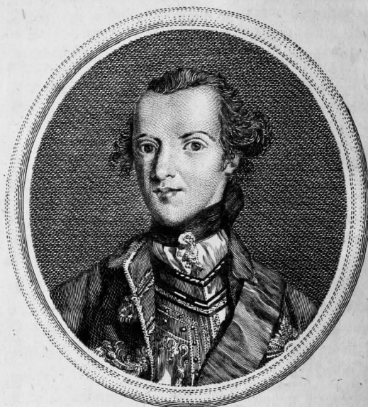
His most Serene Highness CHARLES WILLIAM FERDINAND. Hereditary Prince of Brunswick.