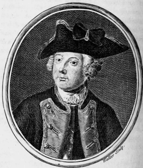
S r . JEFFERY AMHERST.