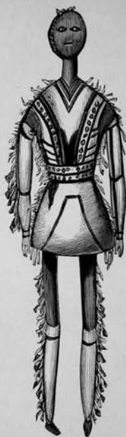
IMAGE USED BY N. AMER. INDIAN CONJURORS.