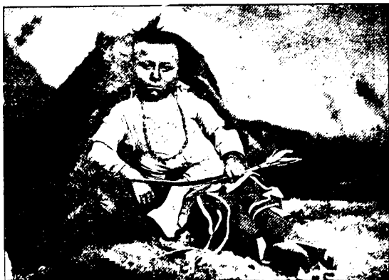
THE STURDY SON OF THE CHIEF.

sight to watch a contest of this kind. The eye can hardly follow not only the arrows but the rapid movements of the archer as he draws the arrows and shoots them with all his might up into the blue sky above. Eight, ten, yes, sometimes even a dozen arrows, are thus sent with wondrous rapidity, sometimes following so closely that it seems as though some succeeding one would catch up to the ones just on ahead. The greater rapidity of the arrow just