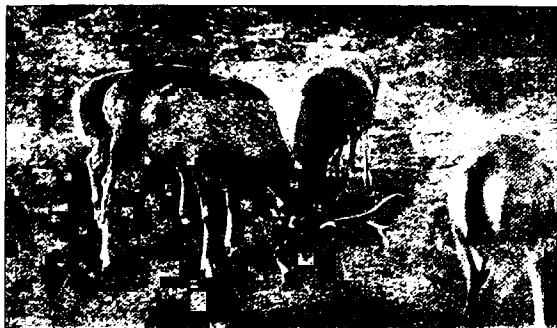
YOUNG DEER ON THE SHORE.