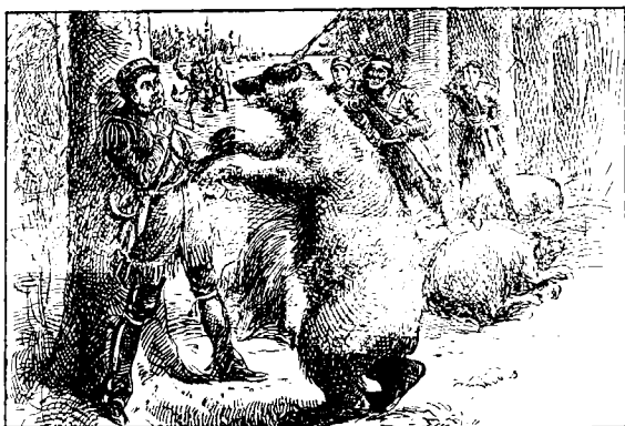
SAM'S SUCCESSFUL THRUST.

On looking over the ground they found four dead bears; one that was badly wounded had managed to crawl away into the forest.