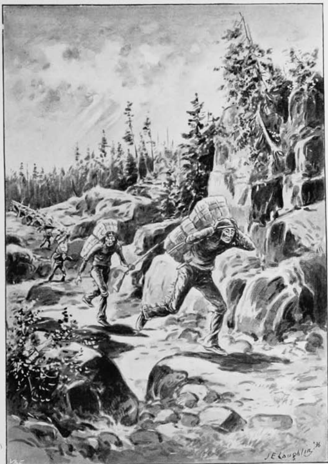
MAKING A PORTAGE.