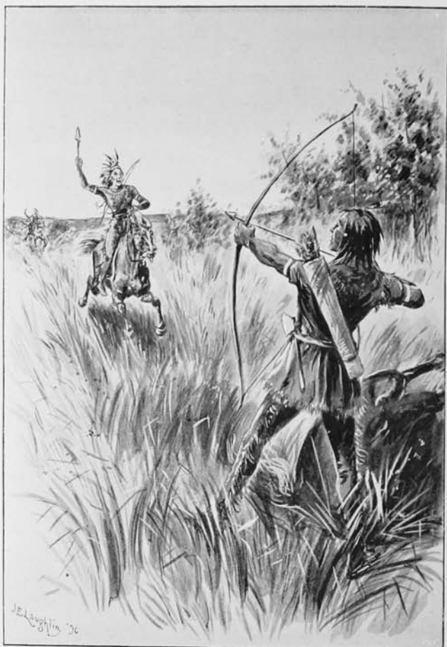
THE AVENGER OF BLOOD.