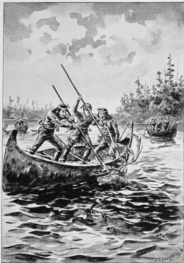
REINDEER ATTACKS THE CANOE.