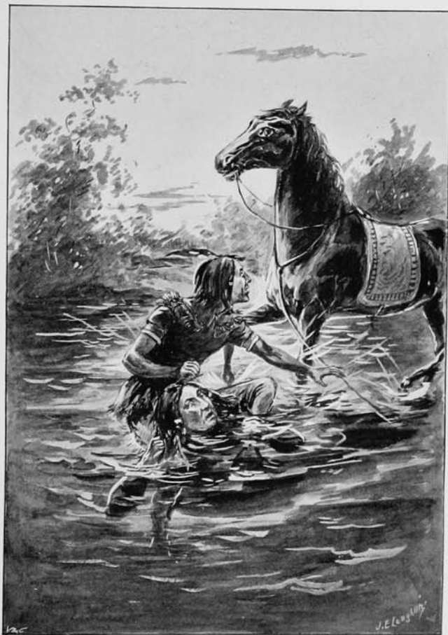
SINKING IN THE QUICKSANDS.