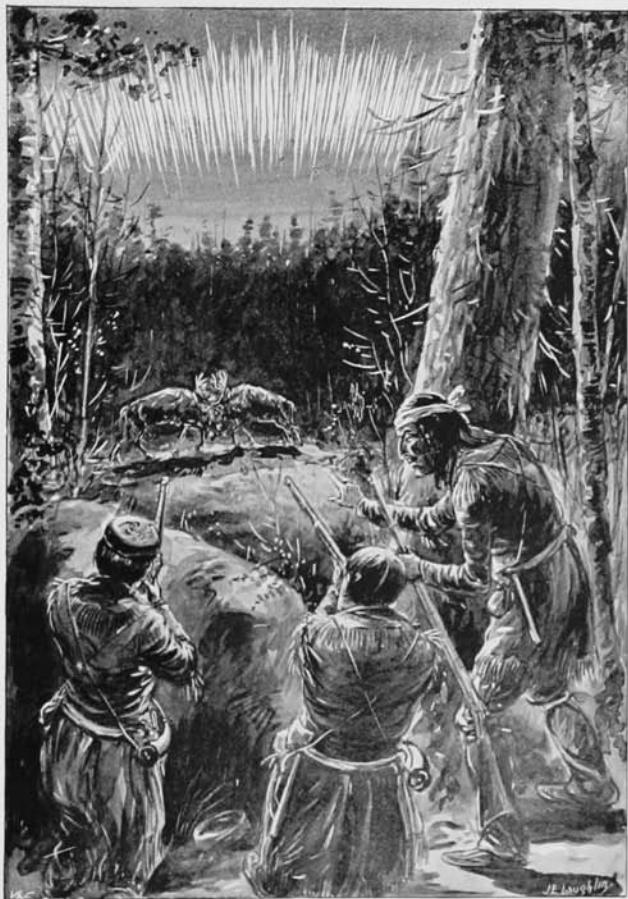
A ROYAL BATTLE.