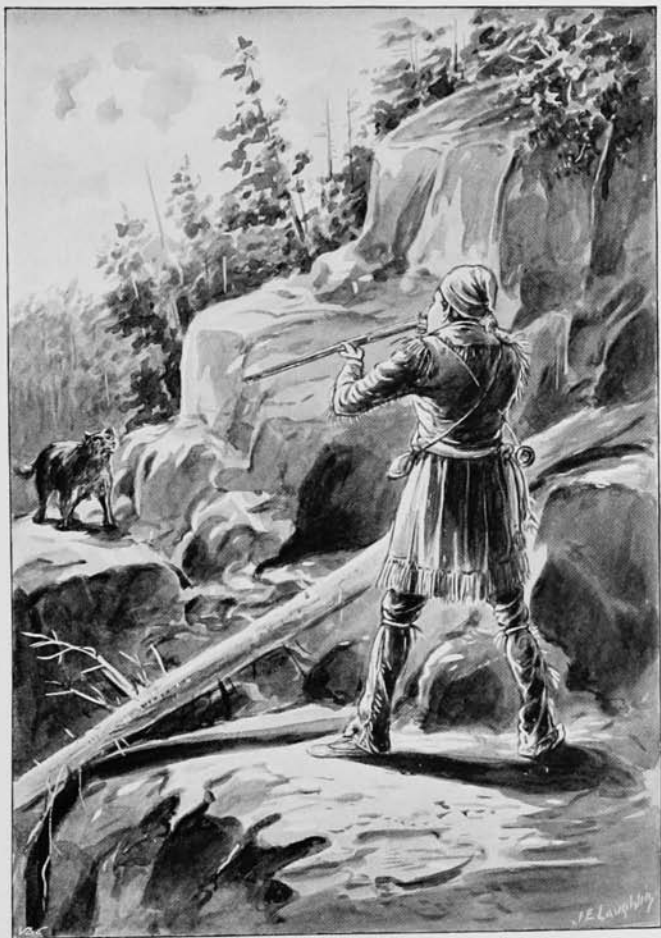
ALEC SHOTS THE WOLVERINE.