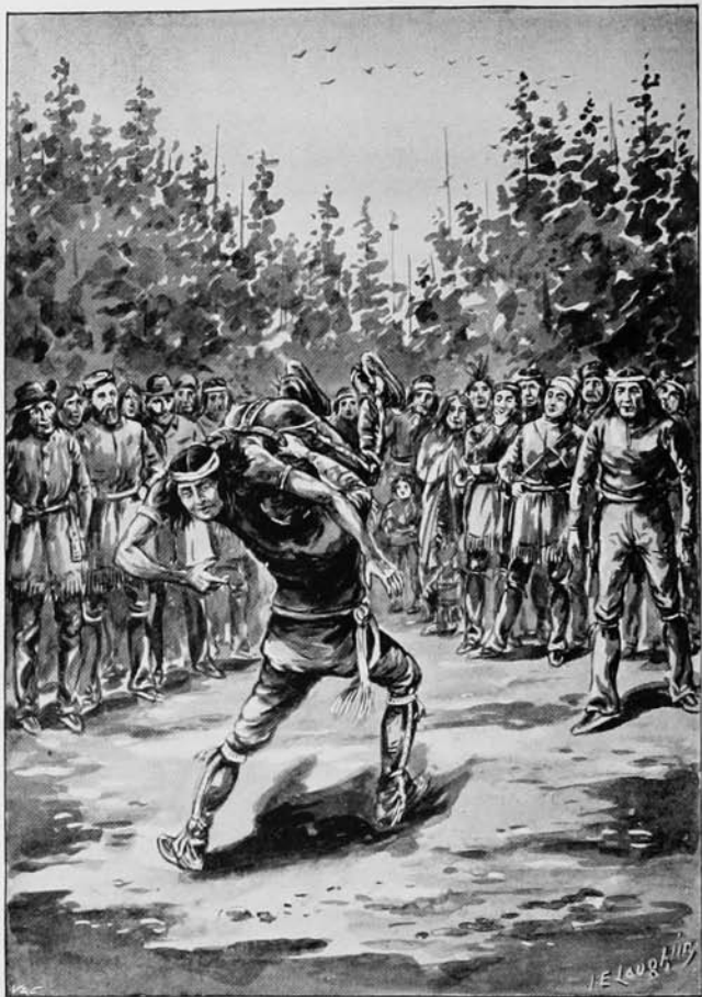
THE WRESTLING MATCH.