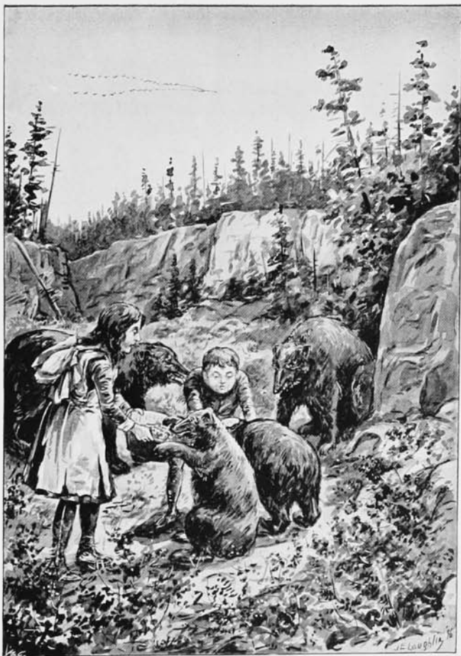
CHILDREN IN THE CUSTODY OF BEARS.