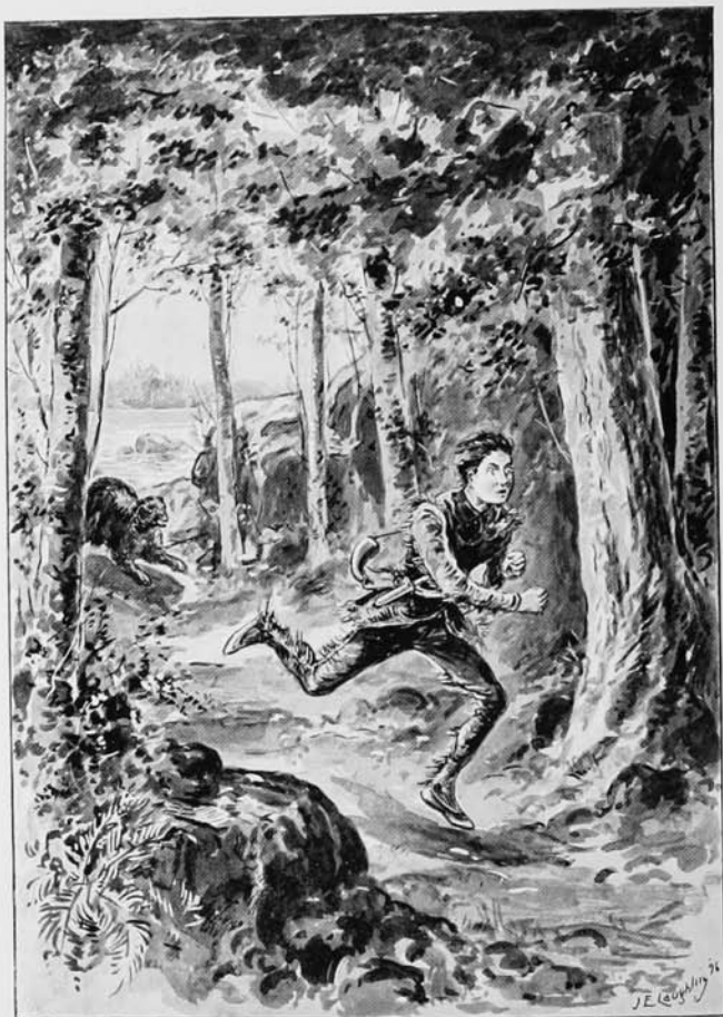
SAM'S RACE WITH A BEAR.