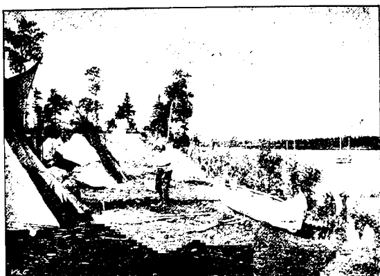
CENTENARIAN INDIAN ENCAMPMENT.

Part of the fish was given to some Indian women and children who were encamped on the islands near which they passed, on the route back to the camp. They also called and left some venison, and a number of fish, with the old, white-haired centenarian Indian, whose encampment of tents and