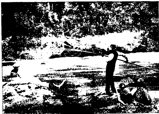
PECULIAR NET FISHING.