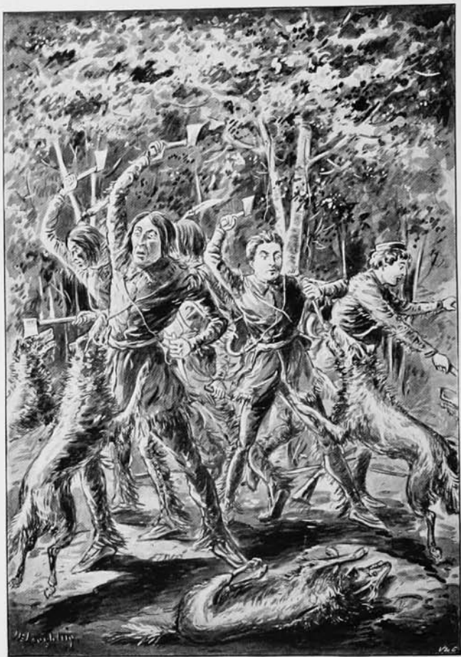
THE FIGHT WITH THE WOLVES.