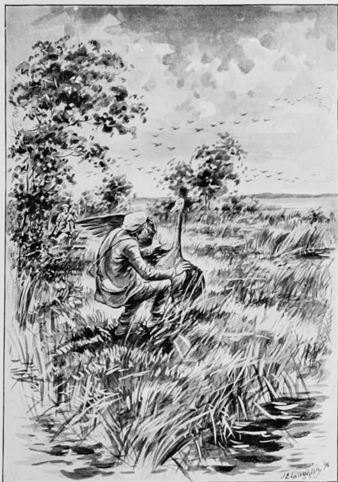
KNOCKED OUT BY A GOOSE.