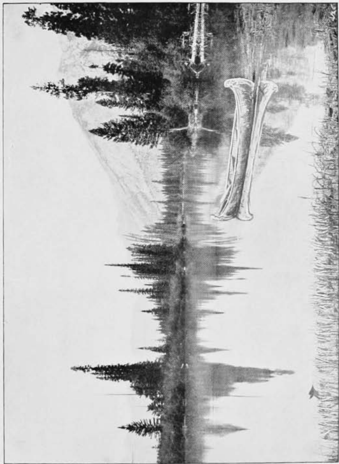
A PAINTER'S VISION—A POET'S DREAM.