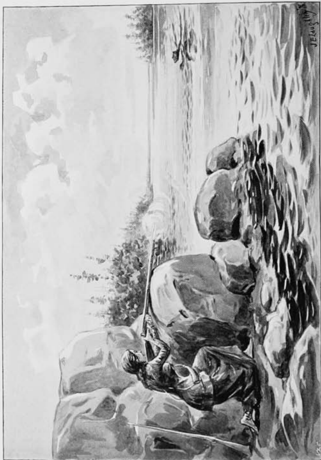
A WOMAN'S SUCCESSFUL SHOT.