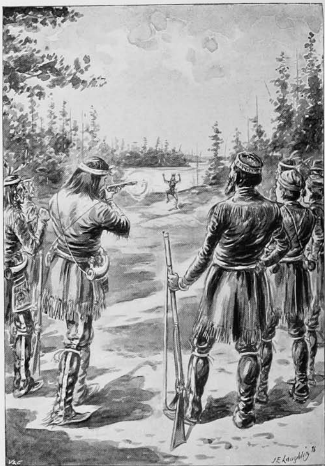
DEFEAT OF THE MEDICINE MAN.